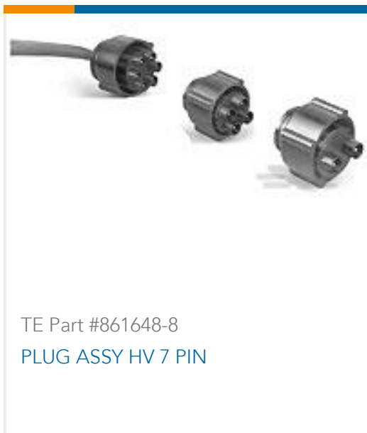
TE Part #861648-8 PLUG ASSY HV 7 PIN