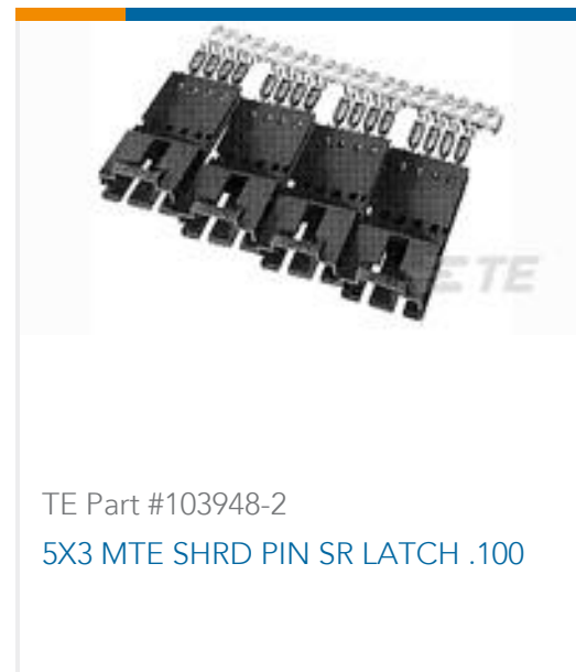
TE Part #103948-2 5X3 MTE SHRD PIN SR LATCH .100