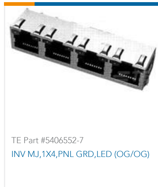
TE Part #5406552-7 INV MJ,1X4,PNL GRD,LED (OG/OG)