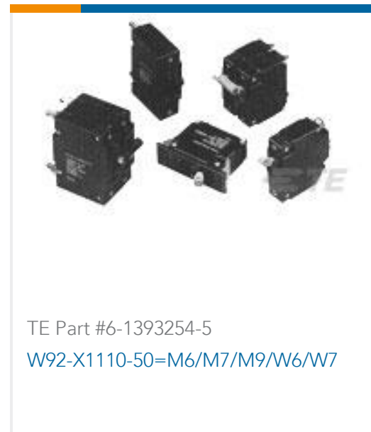
TE Part #6-1393254-5 W92-X1110-50=M6/M7/M9/W6/W7