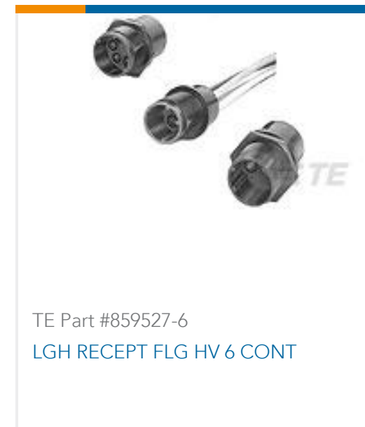
TE Part #859527-6 LGH RECEPT FLG HV 6 CONT