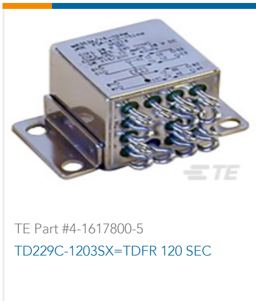
TE Part #4-1617800-5 TD229C-1203SX=TDFR 120 SEC