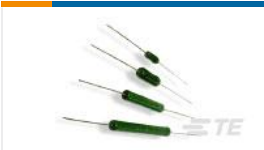
TE Part #1-1623774-3 C14 100K 5% (LOOSE)