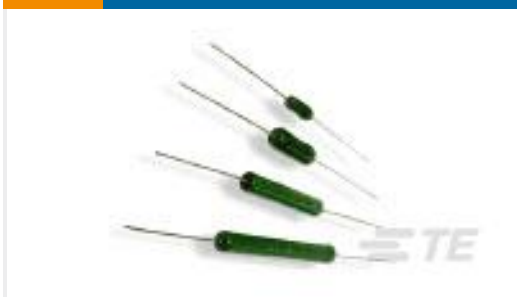
TE Part #1-1623774-8 C14 15K 5% (LOOSE)