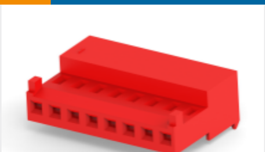
TE Part #3-644020-6 Nylon Gold Plated Receptacle: 2.54 mm, With Mating Alignment, MTA 100