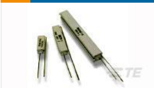
TE Part #2-1623728-3 BCHE 11 W 4K7 5%