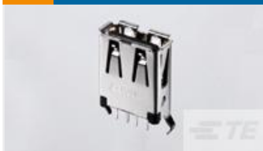
TE Part #1734366-4 Std USB Type A, VT, T/H