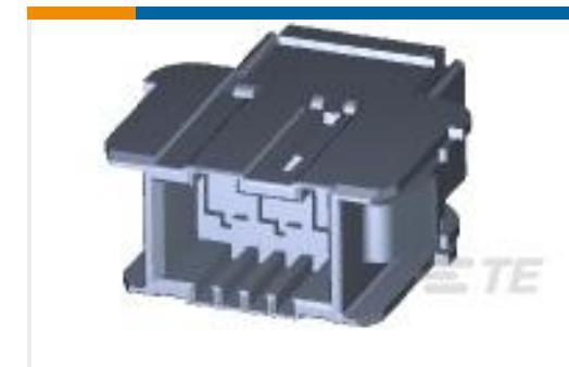
TE Part #293008-3 3 POS. FASTIN-FASTON CONN. TAB HOUSING R