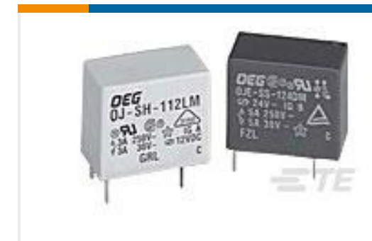
TE Part #3-1419129-1 OJ-SS-124LM,000