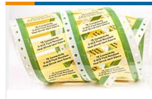
TE Part #517445-000 D-SCE-5K-3.2-50-S1-9