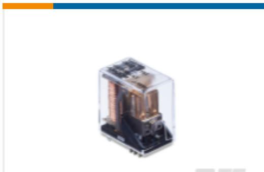
TE Part #1393808-6 Signal Relays: 5 amp, Monostable DC