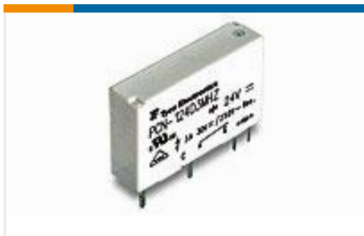
TE Part #3-1461491-7 PCN-104D3MHZ,001