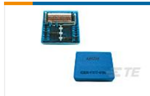
TE Part #2-1393802-0 V23030J1017A206