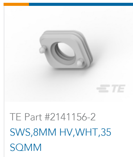
TE Part #2141156-2 SWS,8MM HV,WHT,35 SQMM