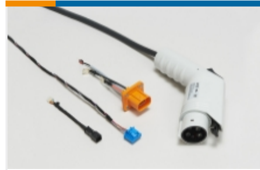
Electric, Hybrid & Fuel Cell Cable Assemblies(10)