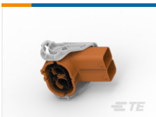
TE Part #1-2141154-2 2POS,8MM HV,REC HSG, 90DEG,ASSY,SEALED