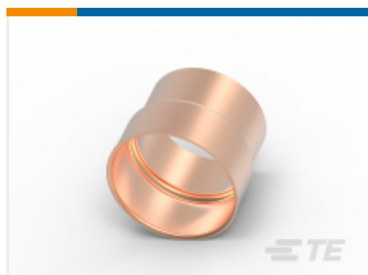
TE Part #9-2141157-2 SHIELD CRIMP FERRULE, 90DEG