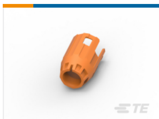
TE Part #2141159-1 FINGER PROT CAP 8MM HV,90DEG