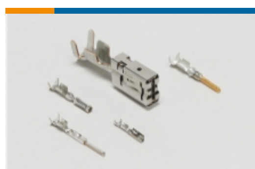
Automotive, Truck, Bus, & Off-Road Terminals(2)