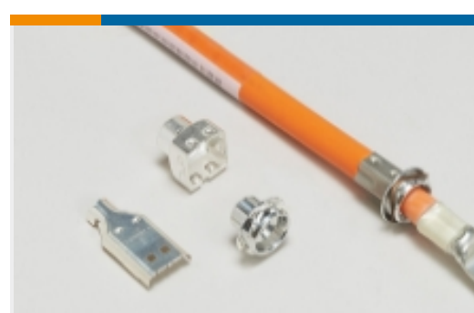
Automotive Connector EMC Shielding(2)