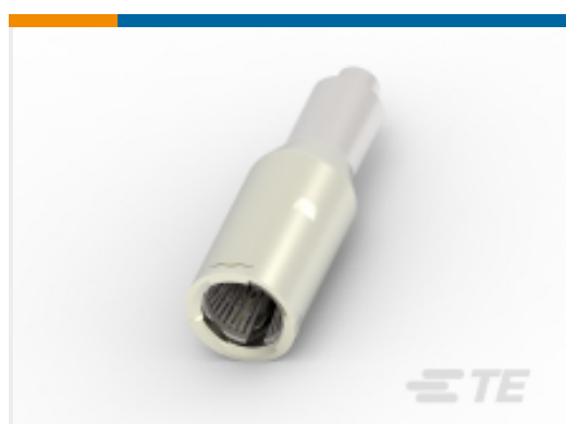
TE Part #2141212-1 8MM HV,SOCKET PIN TERMINAL