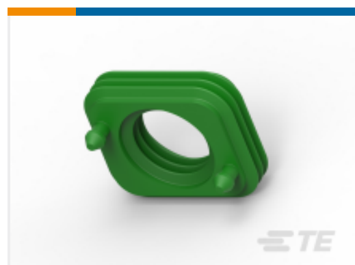
TE Part #2141156-1 SWS,8MM HV,WHT,50 SQMM