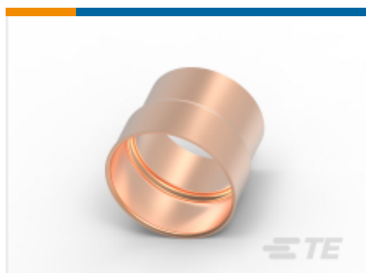
TE Part #9-2141157-1 SHIELD CRIMP FERRULE, 90DEG