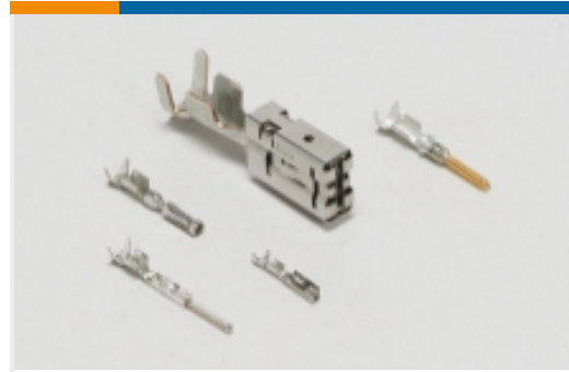
Automotive, Truck, Bus, & Off-Road Terminals(6)