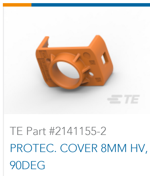
TE Part #2141155-2 PROTEC. COVER 8MM HV, 90DEG