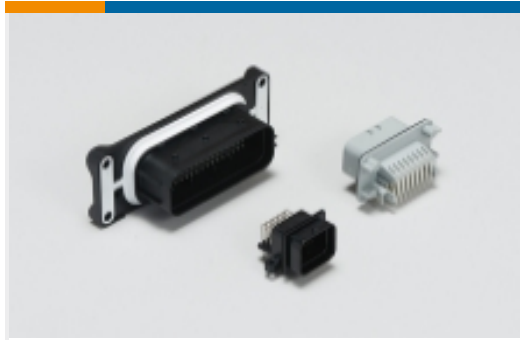
Automotive, Truck, Bus, & Off-Road Headers(27)