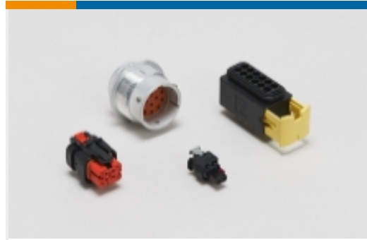
Automotive, Truck, Bus, & Off-Road Housings(29)