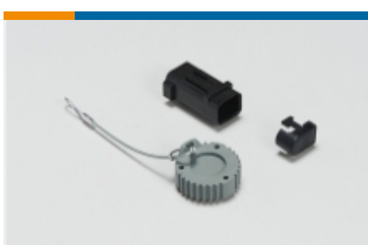
Automotive Connector Caps & Covers(4)