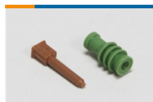
Automotive Seals & Cavity Plugs(3)