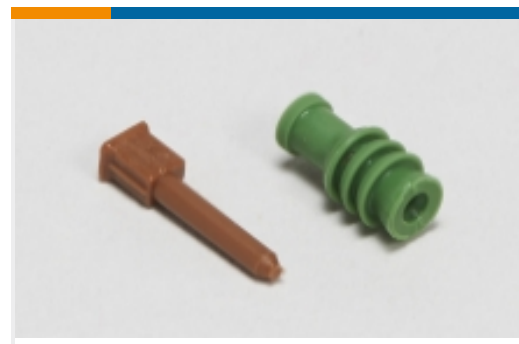
Automotive Seals & Cavity Plugs(5)