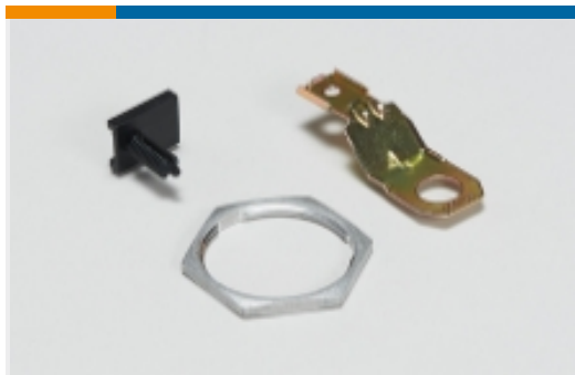
Other Automotive Connector Accessories(1)