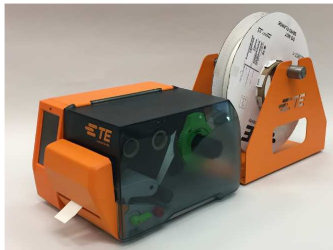
T2212 printer with the Universal reel holder.