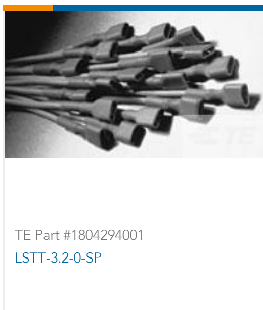
TE Part # 1804294001 LSTT-3.2-0-SP