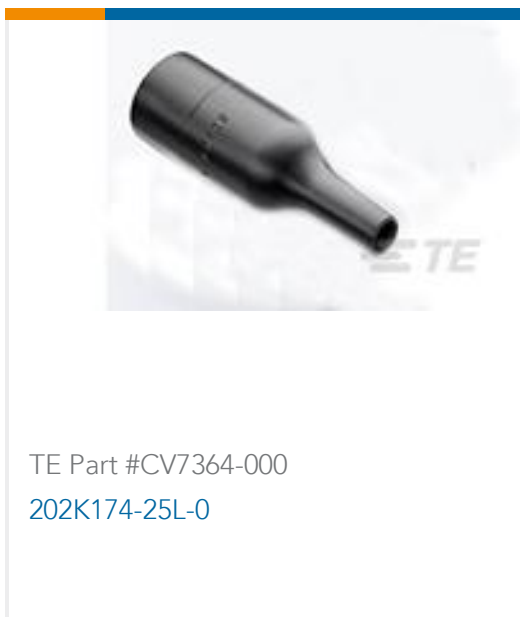
TE Part # CV7364-000 202K174-25L-0