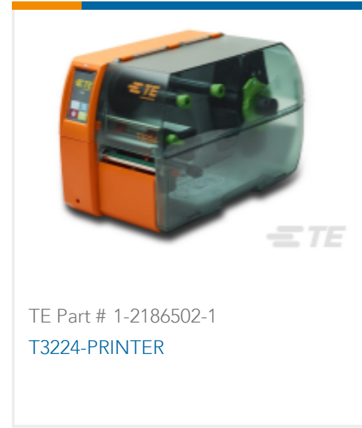
TE Part # 1-2186502-1 T3224-PRINTER