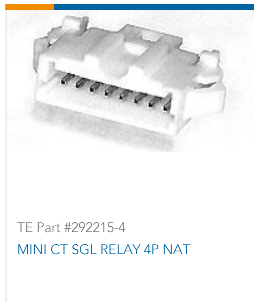
TE Part # 292215-4 MINI CT SGL RELAY 4P NAT