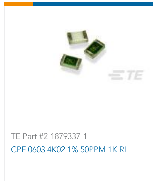
TE Part # 2-1879337-1 CPF 0603 4K02 1% 50PPM 1K RL