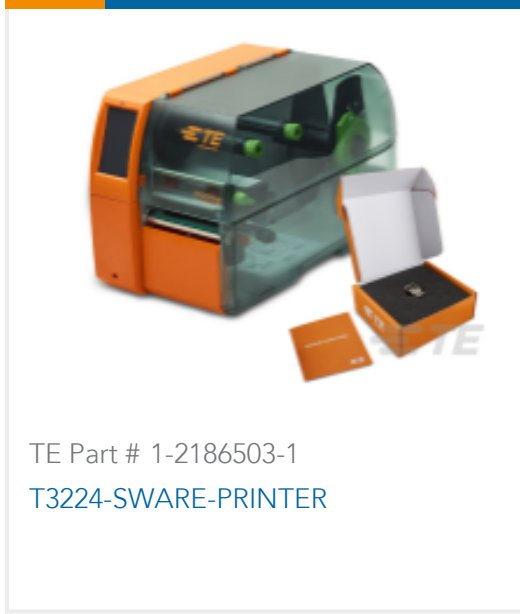
TE Part # 1-2186503-1 T3224-SWARE-PRINTER