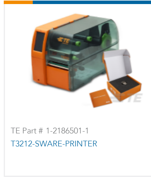
TE Part # 1-2186501-1 T3212-SWARE-PRINTER