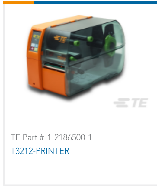
TE Part # 1-2186500-1 T3212-PRINTER