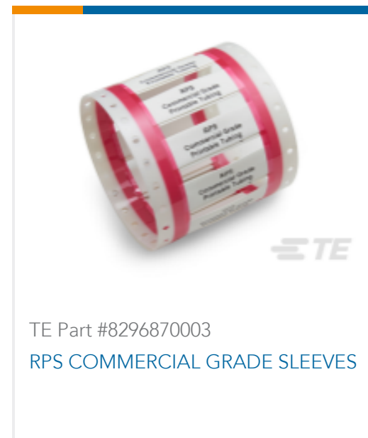
TE Part # 8296870003 RPS COMMERCIAL GRADE SLEEVES