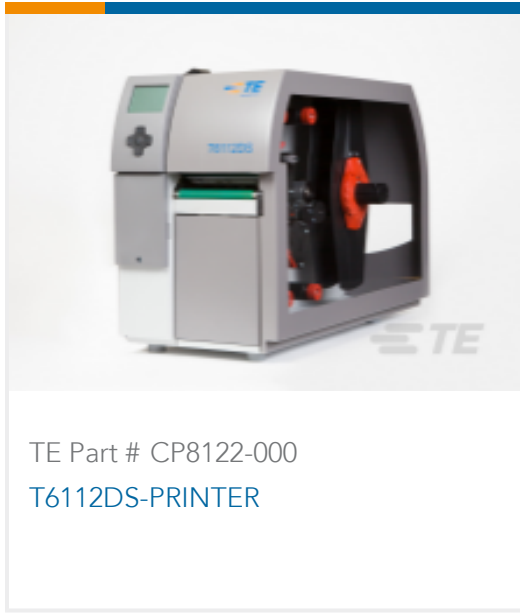
TE Part # CP8122-000 T6112DS-PRINTER