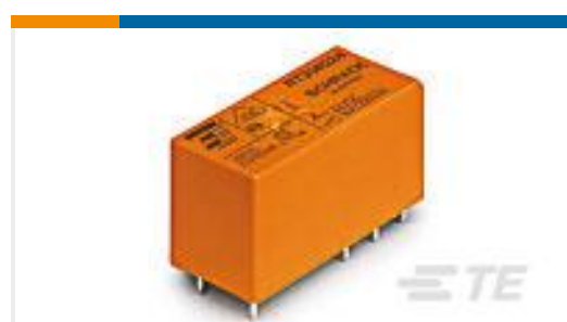
TE Part #3-1393240-5 RT33L024