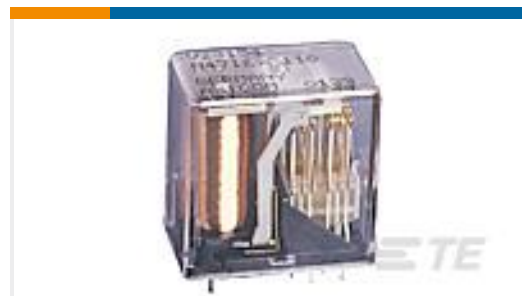
TE Part #3-1393812-8 V23054D 3B110