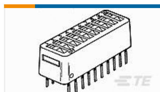
TE Part #4-435626-0 DIP SW 6 POSN W/TAPE AU