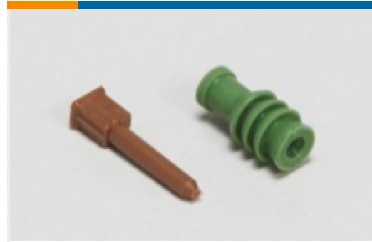
Automotive Seals & Cavity Plugs(4)