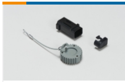
Automotive Connector Caps & Covers (71)