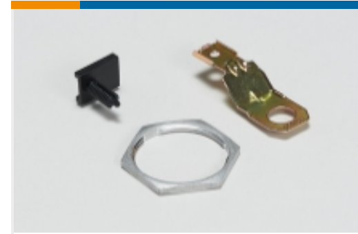
Other Automotive Connector Accessories(13)