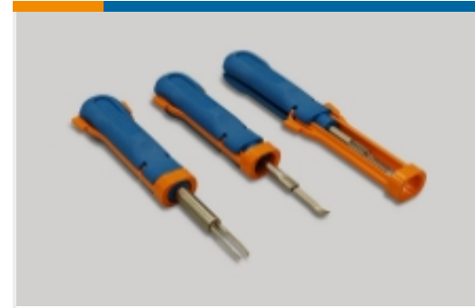
Insertion & Extraction Tools(7)