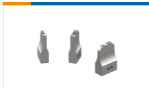
ANVIL REPRESENTATION ONLY