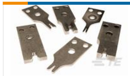
TE Part #3-456402-5 CRIMPER "F" .055