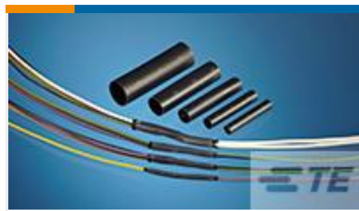
TE Part #CH03472001 OSZH-125-NR1-STK