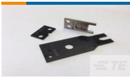
TE Part #459722-7 BLADE, SHEAR