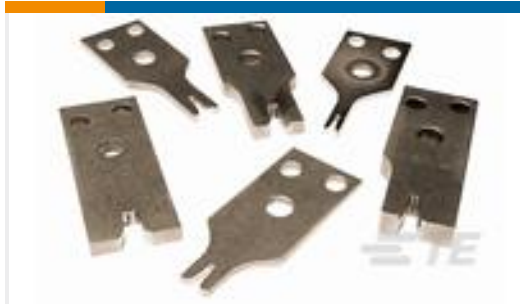
TE Part #9-1633609-3 CRIMPER, WIRE F