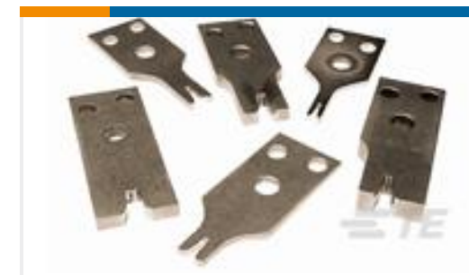
TE Part #1-1633961-2 CRIMPER, INSULATION F PREMIUM 25SQMM