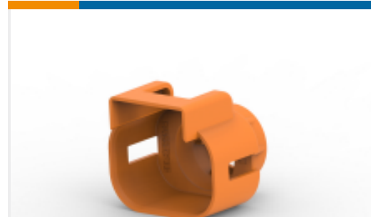
TE Part #2103013-3 CABLE SEAL RETAINER, SIZE 2, OR, HVA280