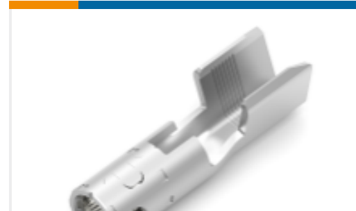
TE Part #2208669-3 8MM HV, CONTACT, ASSY