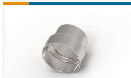
TE Part #2177090-3 STEEL, OUTER FERRULE, 8MM HV, 25SQMM