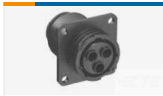
TE Part #788189-2 CPC 17-3 RCPT ASY,REV SEX