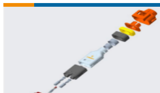
TE Part #YHV280-2PM-P-4MM-B HVA280-2pnm, pass, 4sqmm, Key B