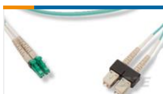
TE Part #8-1920985-1 FOMM62.5 LEAD LC/DPX ODVA - SC/DPX 120M