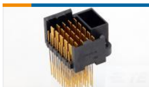
TE Part #5120732-2 Z-PACK HS3 HDR ASSY 30 POS