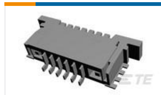
TE Part #487951-6 006 1MM FPC TOP HORZ