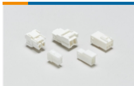
Rectangular Power Connectors(36)