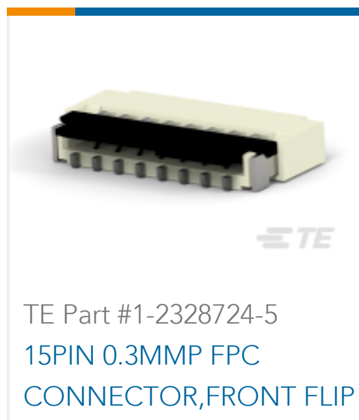
TE Part #1-2328724-5 15PIN 0.3MMP FPC CONNECTOR,FRONT FLIP