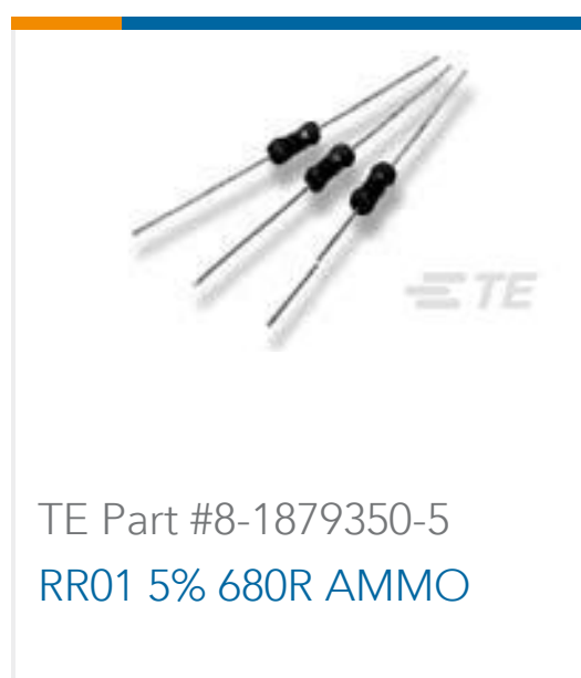
TE Part #8-1879350-5 RR01 5% 680R AMMO