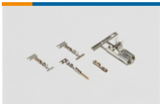
Wire-to-Board Connector Contacts(4)