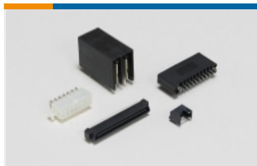
Standard Rectangular Connectors(1)