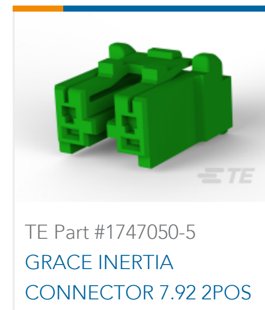
TE Part #1747050-5 GRACE INERTIA CONNECTOR 7.92 2POS PLUG H