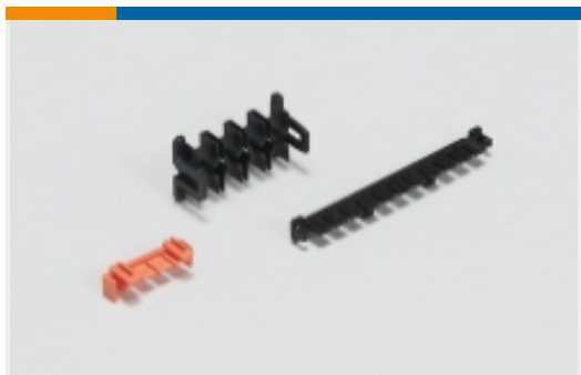
Rectangular Connector Locking(2)