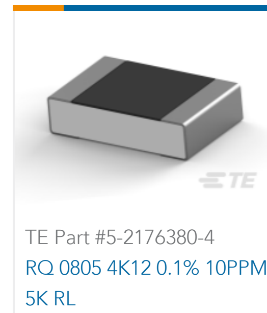
TE Part #5-2176380-4 RQ 0805 4K12 0.1% 10PPM 5K RL