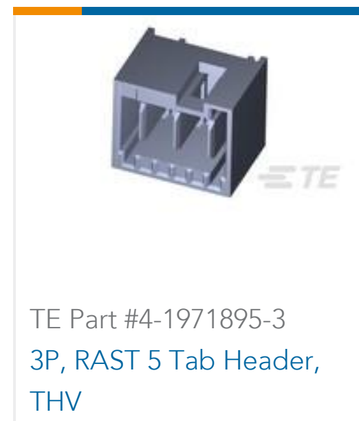
TE Part #4-1971895-3 3P, RAST 5 Tab Header, THV