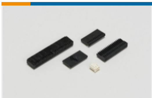
Wire-to-Board Connector Housings(65)