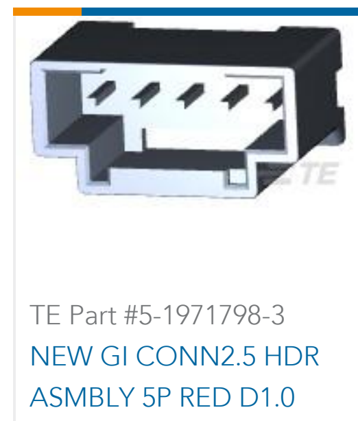
TE Part #5-1971798-3 NEW GI CONN2.5 HDR ASMBLY 5P RED D1.0