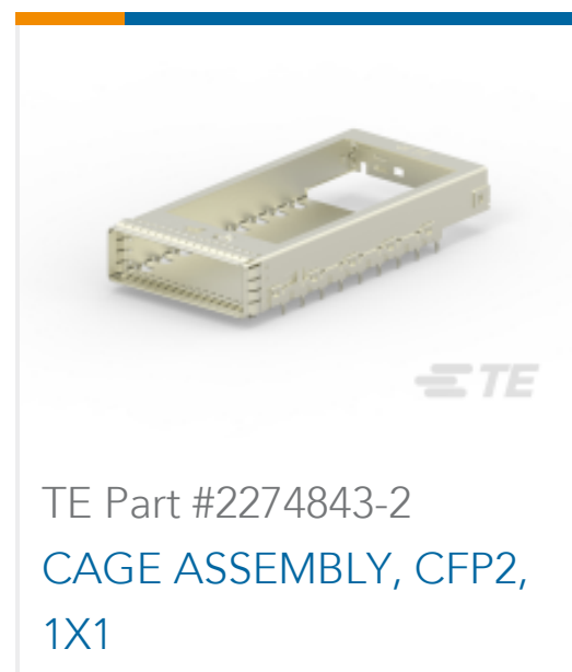
TE Part #2274843-2 CAGE ASSEMBLY, CFP2, 1X1