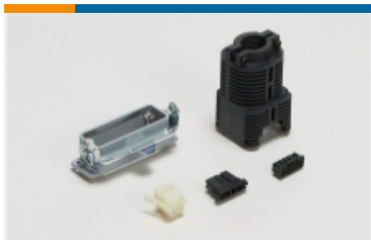
Rectangular Connector Housings(49)