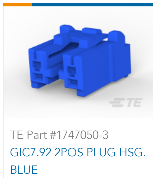
TE Part #1747050-3 GIC7.92 2POS PLUG HSG. BLUE