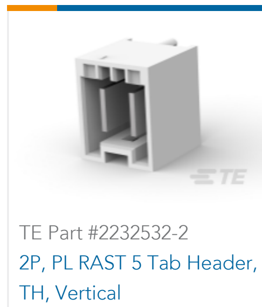
TE Part #2232532-2 2P, PL RAST 5 Tab Header, TH, Vertical