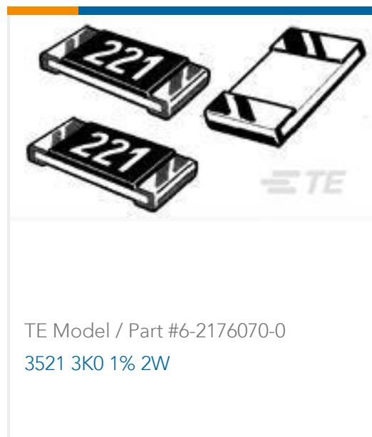
TE Model / Part #6-2176070-0 3521 3K0 1% 2W