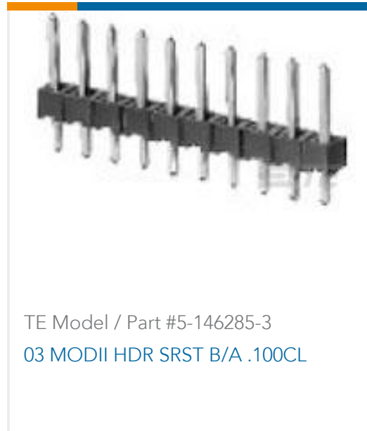
TE Model / Part #5-146285-3 03 MODII HDR SRST B/A .100CL