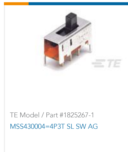
TE Model / Part #1825267-1 MSS430004=4P3T SL SW AG