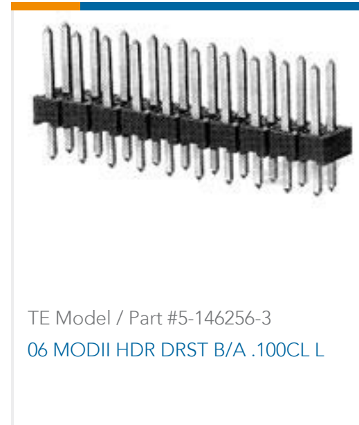
TE Model / Part #5-146256-3 06 MODII HDR DRST B/A .100CL L