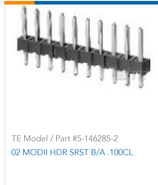
TE Model / Part #5-146285-2 02 MODII HDR SRST B/A .100CL