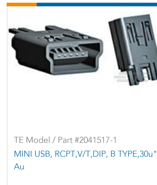
TE Model / Part #2041517-1 MINI USB, RCPT,V/T,DIP, B TYPE,30u" Au"