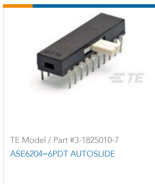
TE Model / Part #3-1825010-7 ASE6204=6PDT AUTOSLIDE