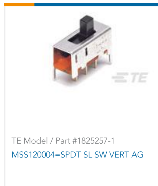
TE Model / Part #1825257-1 MSS120004=SPDT SL SW VERT AG