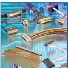
Microdot Connectors and Cables