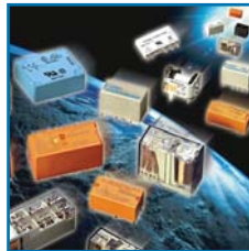
Schrack PCB Relays