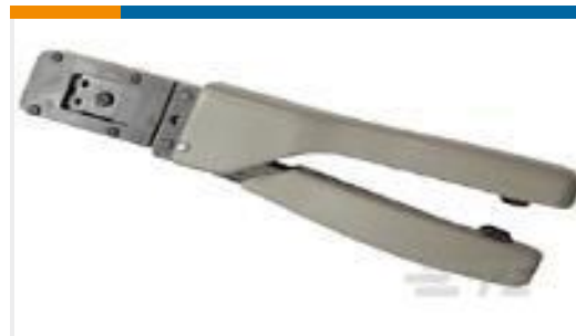
TE Part #1901600-2 CCII PIDG STRATO 18-16 ASSY