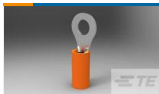
TE Part # 152883 18-16 PIDG R/T NO8 STUD ORANGE