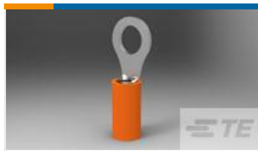
TE Part # 152881 18-16 PIDG RT NO 10STUD ORANGE