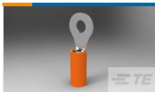
TE Part # 152884 18-16 PIDG RT NO 6 STUD ORANGE