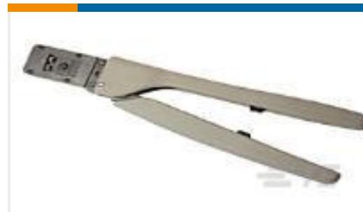
TE Part #1901611-1 CCII PIDG STRATO 24-20 ASSY