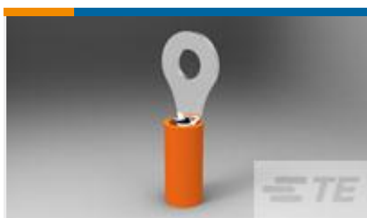
TE Part # 50835 TERMINAL,PIDG PTFE R 18-16 6