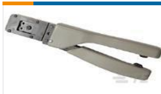
TE Part #1901611-2 CCII PIDG STRATO 24-20 ASSY