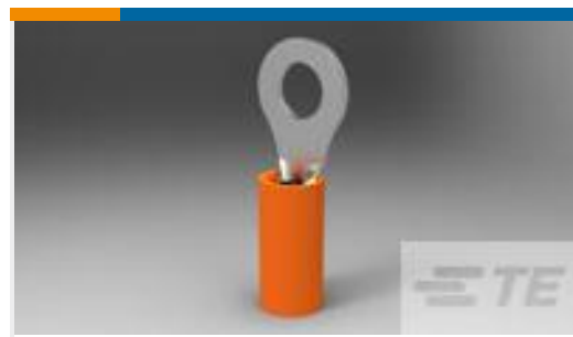
TE Part # 152882 18-16 PIDG RT NO 8 STUD ORANGE