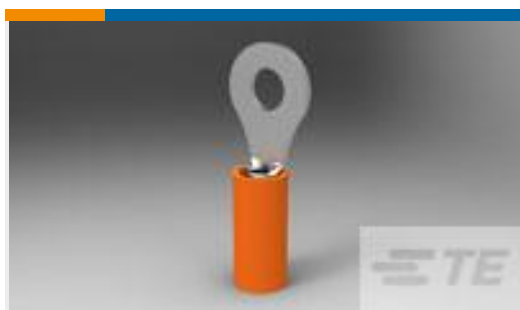
TE Part # 152885 TERM, RING, PIDG, 18-16 AWG, #6, ORNG