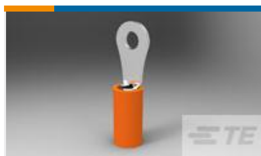
TE Part # 50834 TERMINAL,PIDG PTFE R 18-16 4