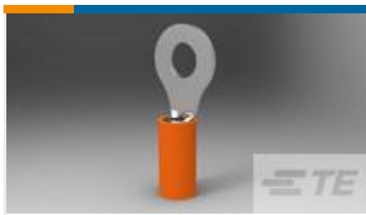
TE Part # 152879 18-16 PIDG R/T 1/4" STUD ORANG