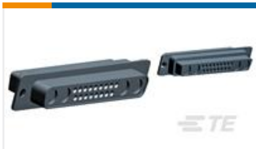
TE Part #5-212534-1 RECEPT ASSY,21C4,AMPLIMITE