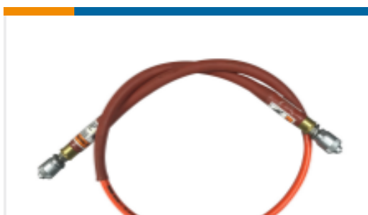
TE Part #1583662-2 HYP10 10FT HOSE