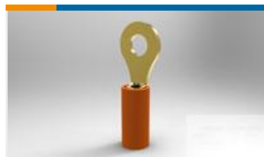
TE Part # 332453 TERMINAL,PIDG PTFE R AU 18-16 6