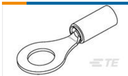
TE Part # 1577634-1 TERMINAL RT PIDG PEEK STRATO 18-16 AWG