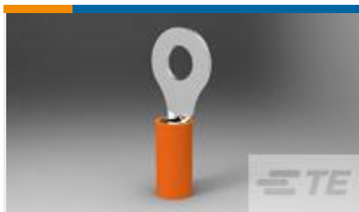
TE Part # 50837 TERMINAL,PIDG PTFE R 18-16 1/4