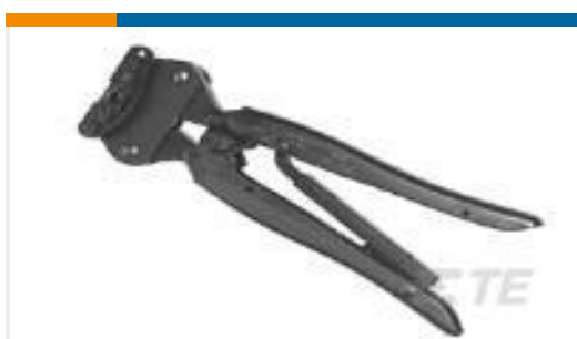
TE Part #46470 SADAHT STRATO 12-10 ASSY