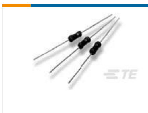
TE Part #5-1879350-8 RR01 5% 51R AMMO