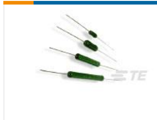
TE Part #1623771-3 C3A 10K 5% AMMO PK