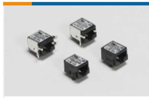
Modular Jack Filters(1)