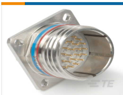
TE Part #YDTS20Z17- 35AAV001 RECP ASSY