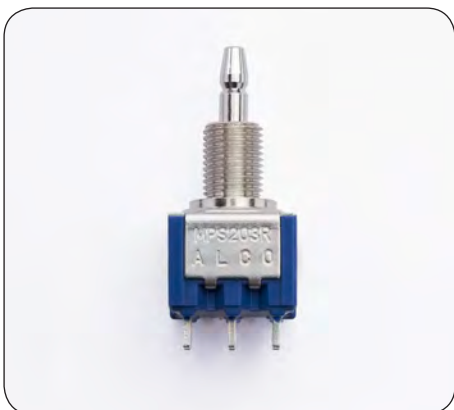
DPDT Wire Lug Silver