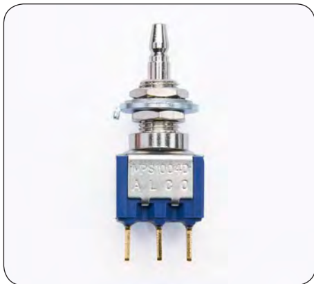
SPDT PCB Gold