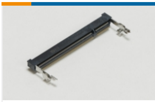
SO DIMM Sockets(30)