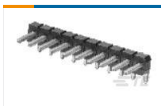
TE Part #5-103329-3 03 MODII HDR SRRRA B/A . 100 CL LF