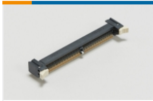
Mini DIMM Sockets(4)