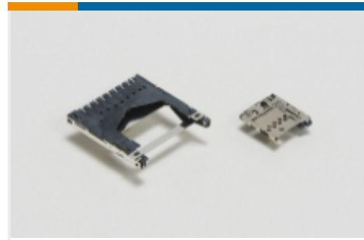
SD Card Connectors(2)