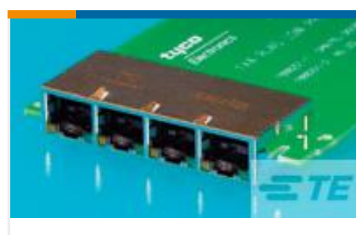
TE Part #1888251-4 low profile rj45, 1x4, grn /grn