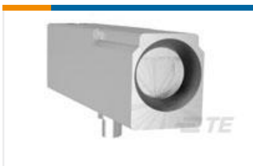
TE Part #5223986-1 UPM KEYED GUIDE MODULE