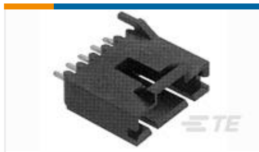
TE Part #6-104809-1 12 MTE HDR SRST LATCH W/HLDWN