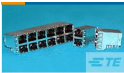
TE Part #1888507-2 2X4 OFFSET,SHLD,STJK ASY W/LED