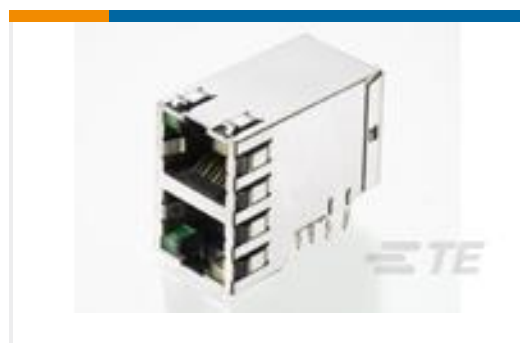
TE Part #1888653-2 2X1 OFFSET ST/JK WITH LEDS