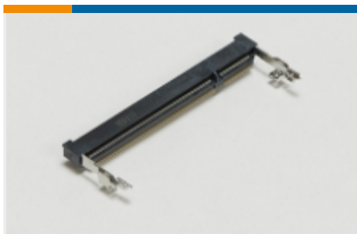
SO DIMM Sockets(16)