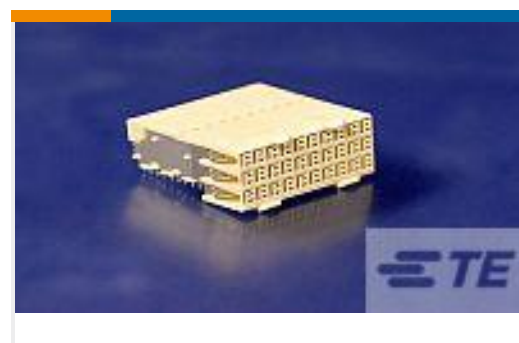
TE Part #6469081-2 HMZD 3PR, RECEPTACLE ASSEMBLY