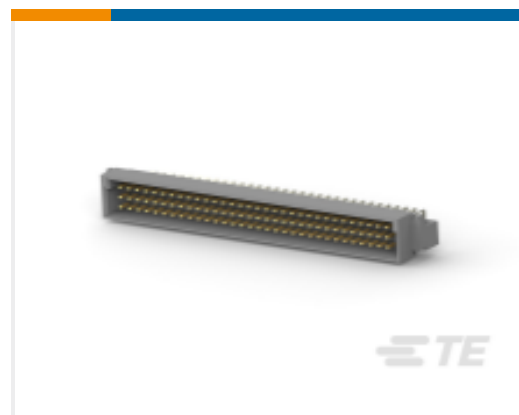
TE Part #650473-3 096 EURO TYPE C PIN ST ASSY