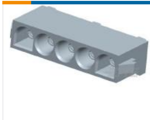
TE Part #2029361-1 05P UMNL SOC HDR V2 NATL NDH