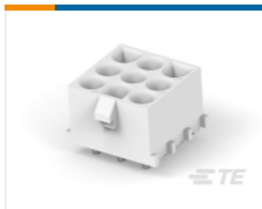
TE Part #5-2029002-1 09P UMNL HDR ASSY PC, NDH