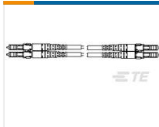
TE Part #2-2064915-5 C/A,F/O,2F I/O MM50 OM3,SCLC DPX