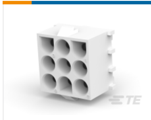
TE Part #2029002-1 09P UMNL HDR ASSY PC, NDH