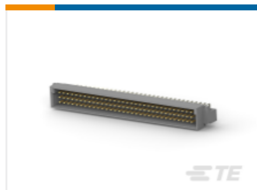
TE Part #650473-3 096 EURO TYPE C PIN ST ASSY