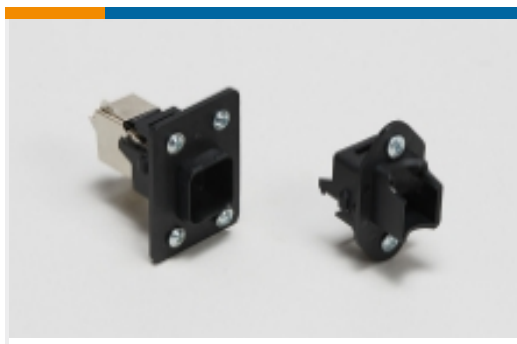
Circular Ethernet Hardware(3)