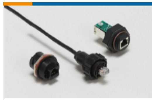
Circular RJ45 Connectors(6)