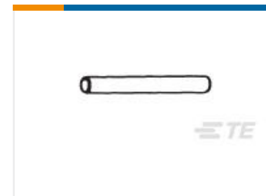
TE Part #1445886-1 RET PIN,75/120/180A,SP,1 HIGH