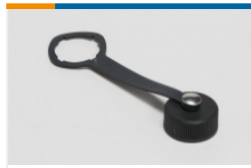
Modular Jack &amp; Plug Caps &amp; Covers(1)