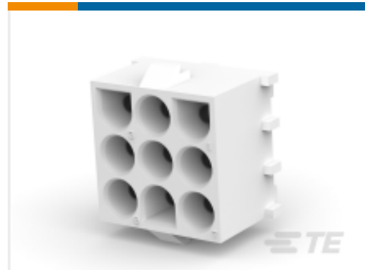
TE Part #2029002-1 09P UMNL HDR ASSY PC, NDH