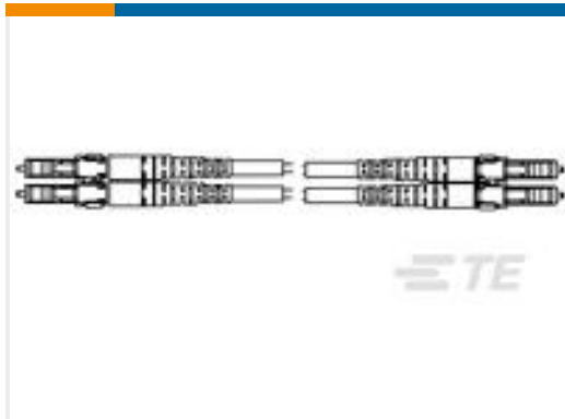
TE Part #2064915-8 C/A,F/O,2F I/O MM50 OM3,SCLC DPX, 8M