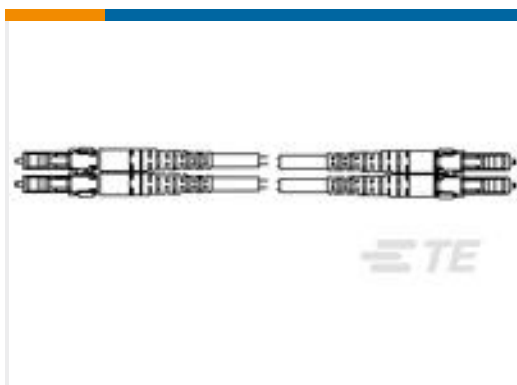
TE Part #2064915-3 C/A,F/O,2F I/O MM50 OM3,SCLC DPX