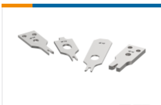
TE Part #5-2119784-7 CRIMPER INSULATION O PREMIUM