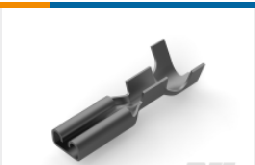
TE Part #444406-1 REC. 110 SERIES FATIN- ON