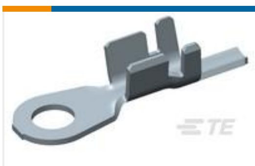
TE Part #881016-2 RING TONGUE 6.0-10.0 MM2 1.00X22.7 TPBR