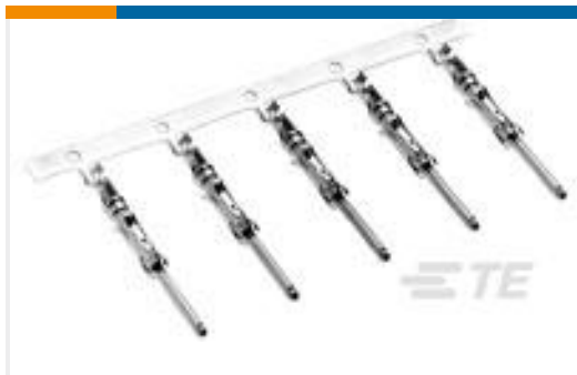
TE Part #66098-2 III+ PIN,18-16,TIN-LEAD, STRIP