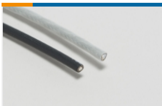
High Speed Digital & Data Cable(19)