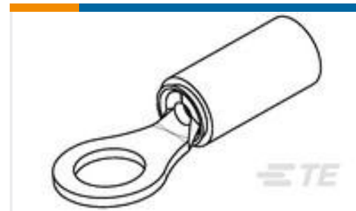
TE Part #1577633-1 TERMINAL RT PIDG PEEK STRATO 18-16 AWG