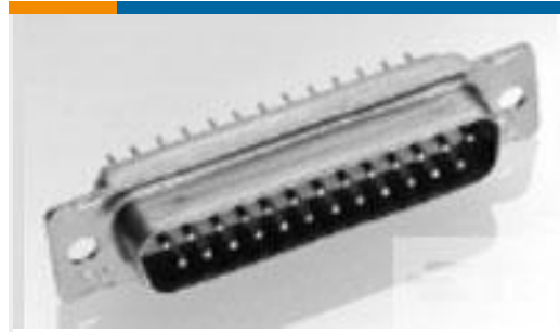
TE Part #1757819-7 AMPLIMITE,ASY,PLUG,STD,109,ZN,2,CT