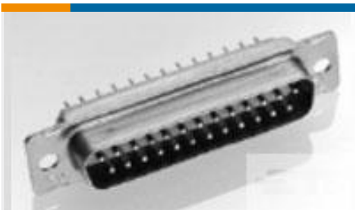
TE Part #1757820-9 AMPLIMITE,ASY,RCPT,STD,109,ZN,4,CT