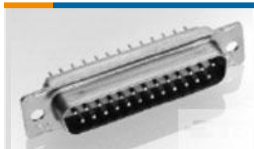
TE Part #1757823-7 AMPLIMITE,ASY,PLUG,STD,90,ZN,1,CT