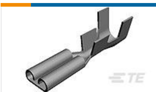
TE Part #160625-2 110 FASTON,REC.,20-17 AWG,TPBR