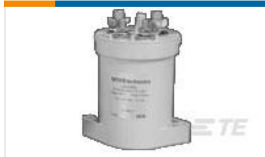
TE Part #7-1618391-4 LEV200ABNAA=RELAY, SPST-NO