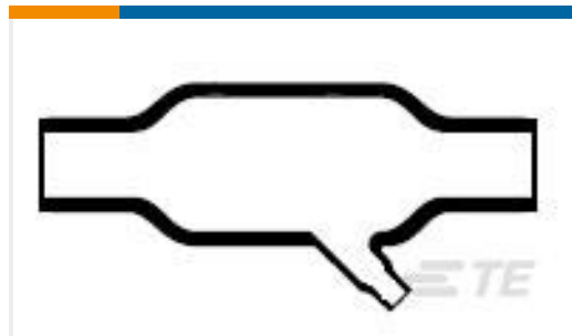
TE Part #638705-000 342A012-4/86-0