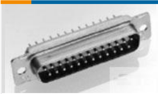
TE Part #204520-2 RECEPT ASSY,78 POSN,AMPLIMITE