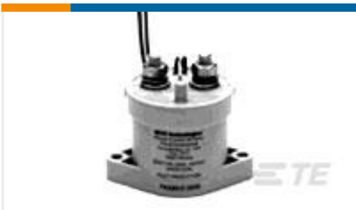
TE Part #1618002-7 EV200AAAANA=RELAY, EV200 SPST-N