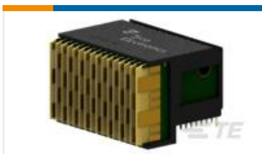
TE Part #1410187-3 MULTIGIG RT T2 7RW DC DF CT