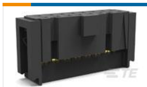
TE Part #1658527-7 622-1641LF FEM SOCKET, LEAD FREE