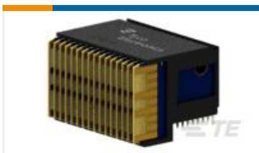
TE Part #1410190-3 MULTIGIG RT T2 7RW DC SE CT RT2