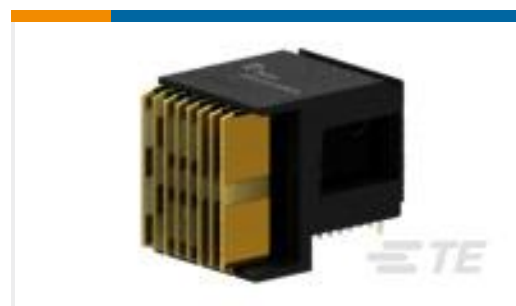
TE Part #1410189-3 MULTIGIG RT T2 7RW H-LFT, ET2