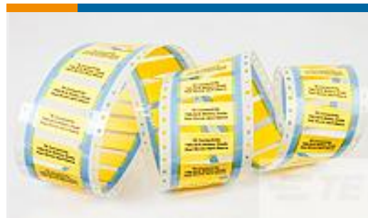
TE Part #1099510001 TMS-SCE-1K-3/16-2.0-9