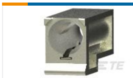
TE Part #1-1469492-2 MULTIGIG RT 9MM GUIDE/ESD 45 DEG