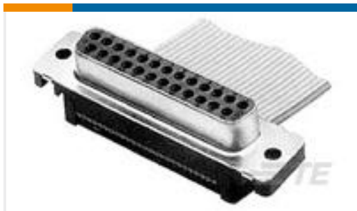
TE Part #1658610-1 37 POS HDF RCPT, MS, LEAD FREE