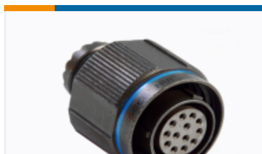
TE Part #YDTS26F19-35SCV001 PLUG ASSY