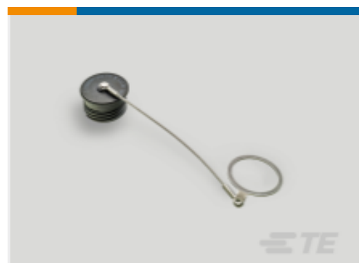
TE Part #YDTS32Z17NV0010000 CAP ASSEMBLY