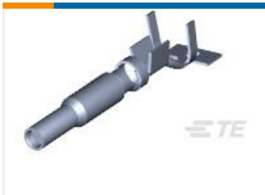
TE Part #1-770006-0 UMNL II SOK SN/AUNI/PHBZ