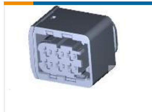
TE Part #2-1418437-1 6POS,AMP MCP2.8,REC HSG,ASSY, SEALED