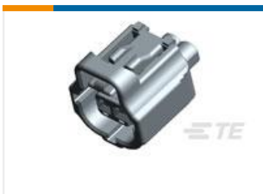
TE Part #184000-1 2 POS. PLUG ASSY, KEY A, BLACK