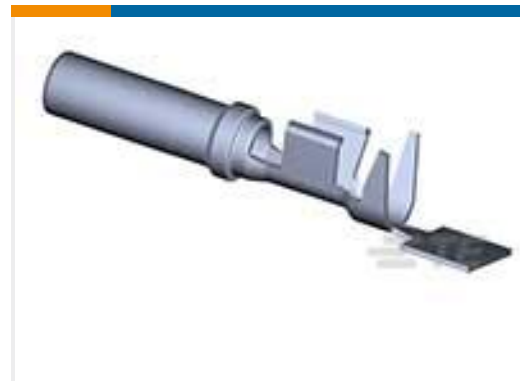
TE Part #1062-12-0144 SOC, SF, SIZE 12, 12-14, AU/SN