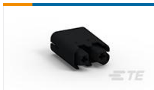
TE Part #1587977-2 INNER HOUSING, PLUG, HVA280-2PHM, PASS T