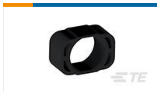
TE Part #2103153-1 SPACER, HVA280-2PHM