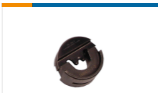
TE Part #1-1490413-4 NEST, 90 DEG SOLISTRAND, 8