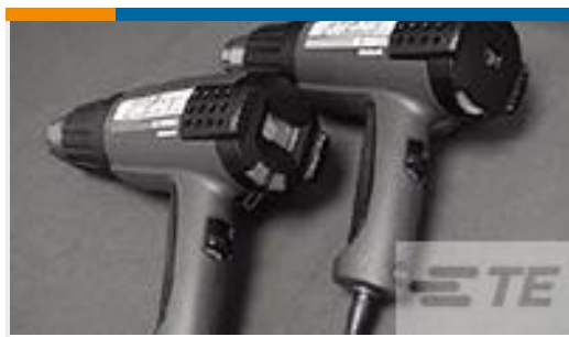
TE Part # CJ2087-000 HL2010E-KIT-120V