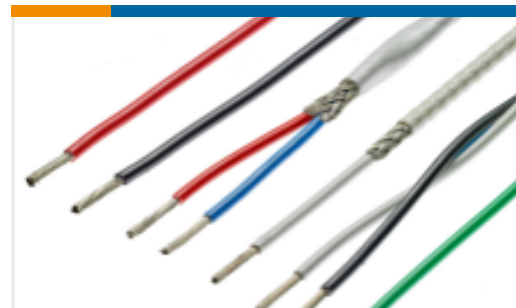
TE Part #245409-000 44A0131-22-9/93/96CS2275