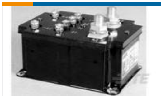
TE Part #1616060-1 A931F=CONTACTOR, SPST-NC, 600A