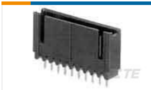
TE Part #103414-1 03 MODII HDR SRST SHRD .100CL