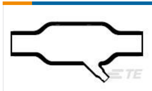
TE Part #153282-000 342A012-25/225-0