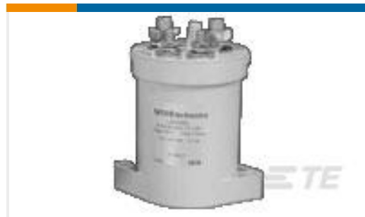
TE Part #3-1618391-7 LEV100A6ANG=RELAY,SPST-NO, 48VDC VMT 15