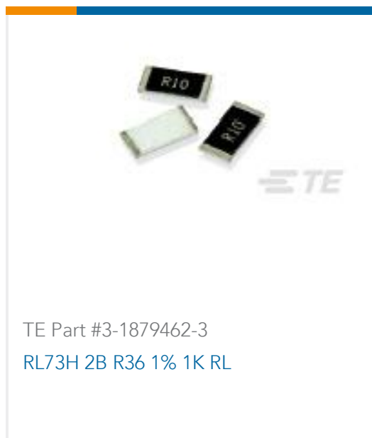
TE Part #3-1879462-3 RL73H 2B R36 1% 1K RL