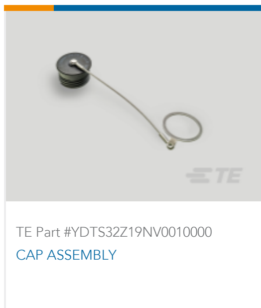
TE Part #YDTS32Z19NV0010000 CAP ASSEMBLY