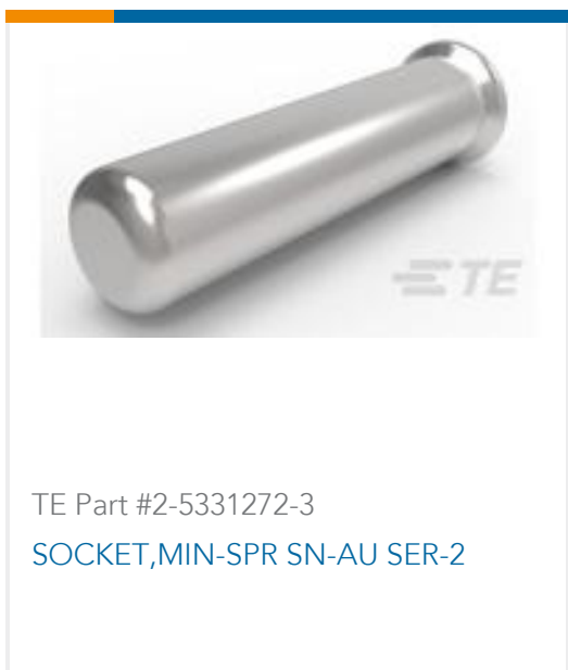
TE Part #2-5331272-3 SOCKET,MIN-SPR SN-AU SER-2