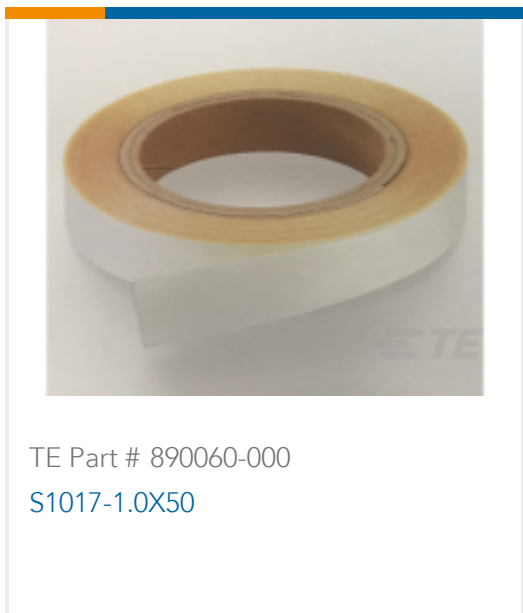
TE Part # 890060-000 S1017-1.0X50