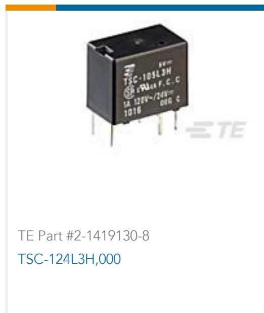
TE Part #2-1419130-8 TSC-124L3H,000