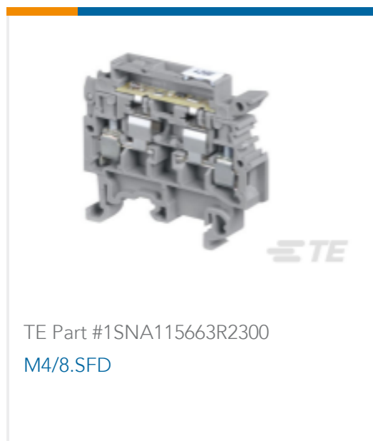
TE Part #1SNA115663R2300 M4/8.SFD