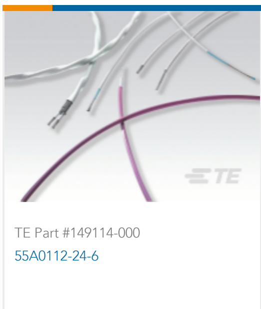
TE Part #149114-000 55A0112-24-6