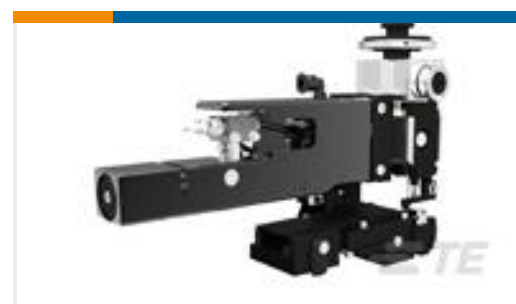
TE Part #2151392-2 OCEAN_2.0_Applicator-S-080F1600