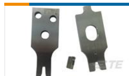
TE Part #7-2151181-7 OCEAN_2.0_SPARE_PART_KIT-080F1600