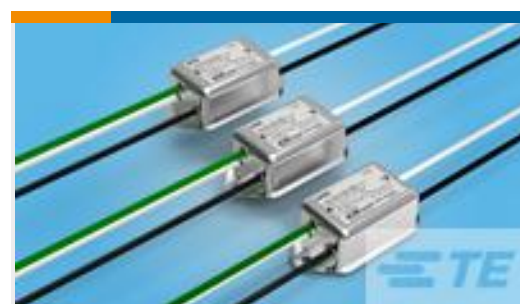
TE Part #8-1609095-9 2FB3=F8361