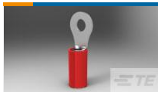
TE Part #1-320551-3 TERMINAL,PIDG R IR 20 8