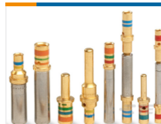
TE Part #0641-1-2031L CONT PIN