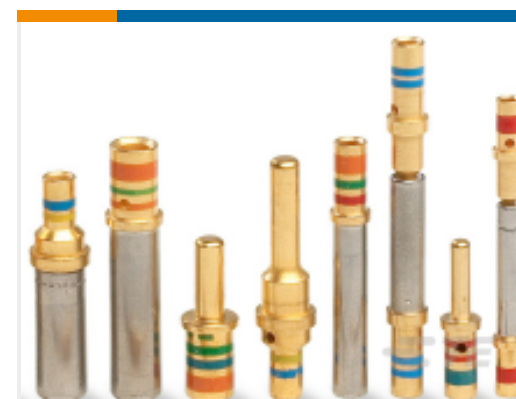
TE Part #ZPF00000000139669 M39029/64-369