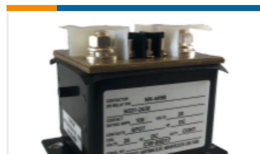
TE Part #1616095-5 NN449B (FAA/PMA)=RELAY