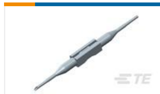
TE Part #110219-000 CTA-1160