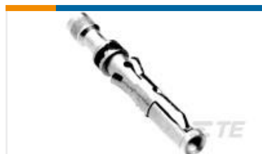
TE Part #201580-1 SKT CONT ASSY,TYPE II