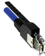
With Pull Tab PNs 2100356/357 PNs 2142758/759