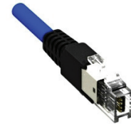
Without Pull Tab PNs 2159683/684