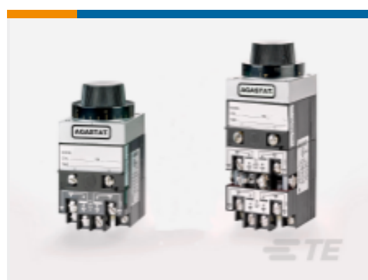
TE Part #7-1472995-0 7012WDS=RLY,STD,ON, 2P,96V,50S,S