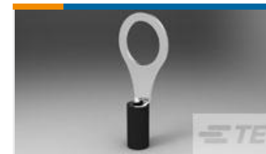
TE Part #342066 16-14 H.D.R/T 1/2" STUD BLACK