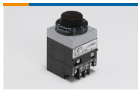
Time Delay Relays(24)