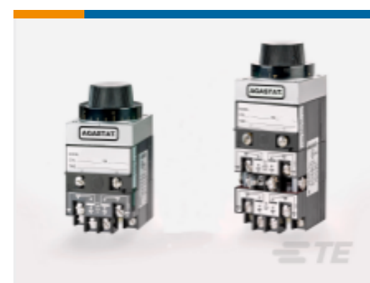
TE Part #9-1755142-1 7022NKIST=RLY,STD,OFF, 2P,48V,300S,I