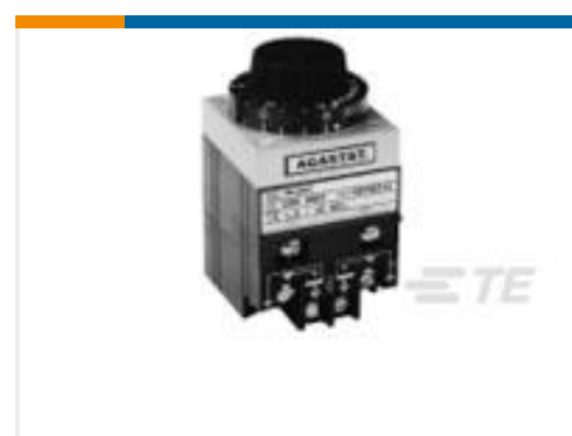
TE Part #6-1755142-4 7022WDIM=RLY,STD,OFF, 2P,96V,50S,I,M