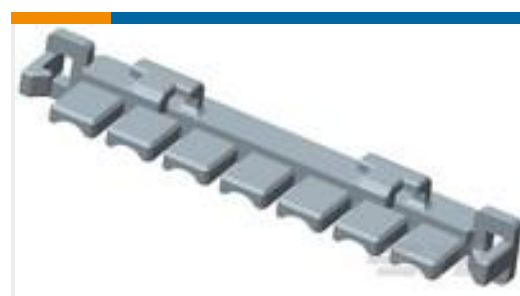
TE Part #1-1969609-2 12P VAL-U-LOK TPA 26-22 AWG