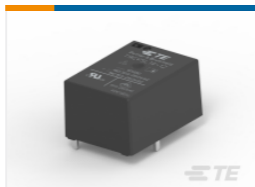
TE Part #1558662-4 T9GV2L14-15