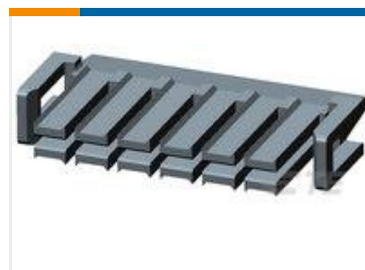
TE Part #2-1969541-8 RETAINER, TPA, DUAL ROW, EP2.5