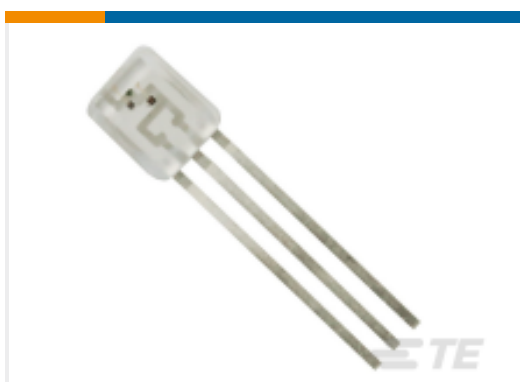
TE Part #11032254-00 EMITTER 660/940NM 1 2