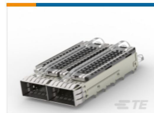
TE Part #2170808-1 QSFP28, 1X2, CAGE ASSY, SPRING, HS, LP