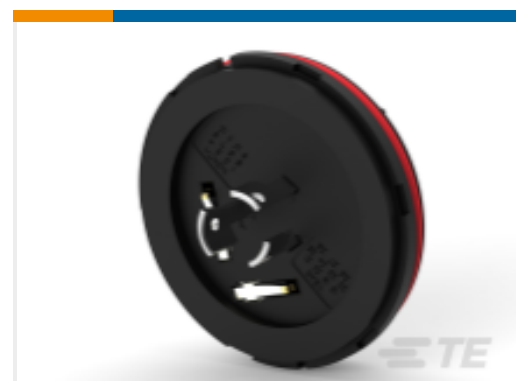
TE Part #1-2336396-1 ASSEMBLY, LIGHT CONTROLLER BASE, W/VENT