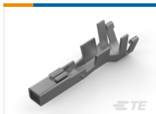
TE Part #177915-9 POWER DBL LOCK REC CONT