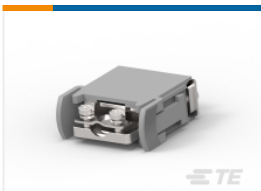
TE Part #T2111092201-007 HMN-009-F