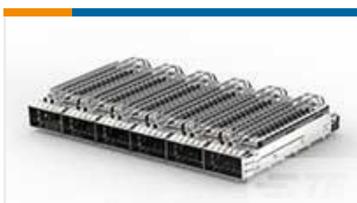
TE Part #2-2170708-1 CAGE ASSY, 1X6, QSFP28, SPRING, HS, LP