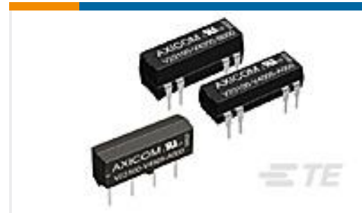
TE Part #2-1393763-3 V23100V4305C11