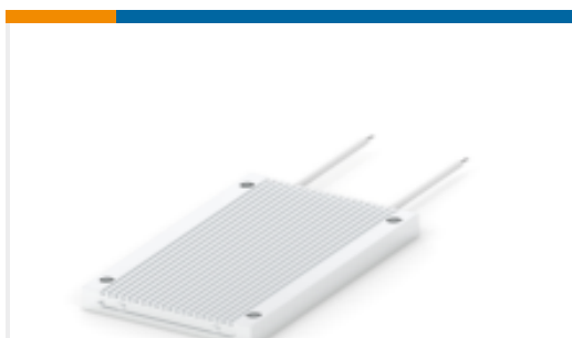
TE Part #2176247-2 TJT 150W 1R5 5%