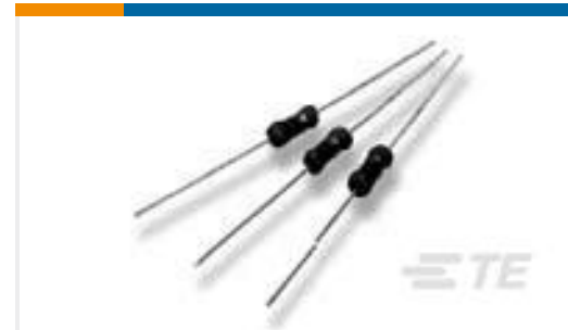
TE Part #4-1625885-1 1W SM M/OX 5% 1R8