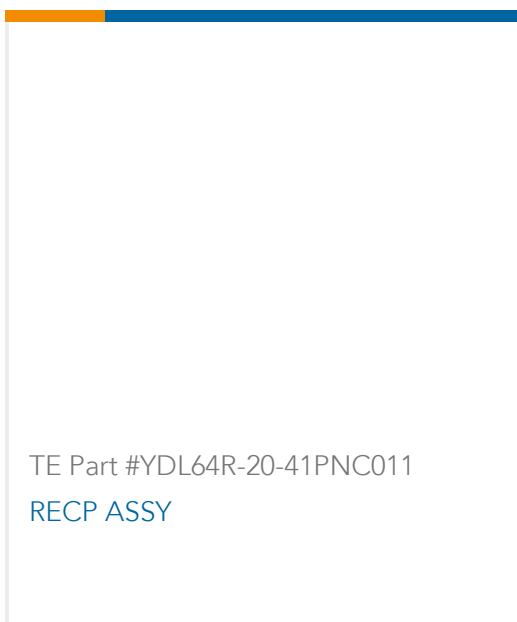
TE Part #YDL64R-20-41PNC011 RECP ASSY