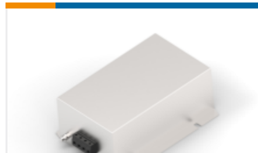
TE Part #1-1609968-6 KEP 36A 1S HIGH PLUS SP WYE 440VAC