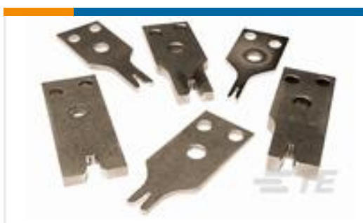
TE Part #5-456406-9 CRIMPER, WIRE .090 "F"