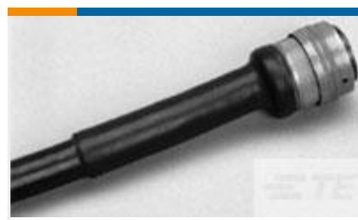
TE Part #CV67236001 ATUM-24/8-2-40MM