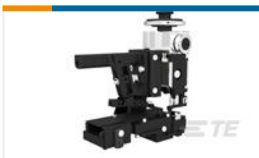
TE Part #2151997-1 OCEAN-2.0-APPLICATOR-S-090F130F