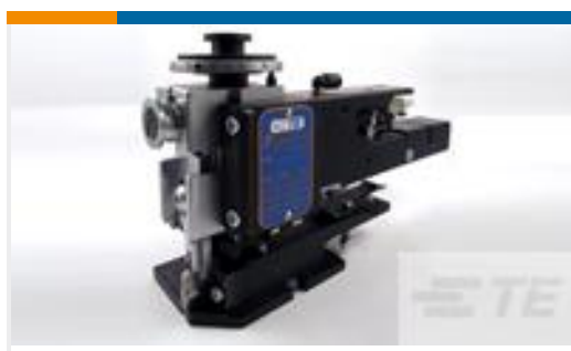
TE Part #2150037-2 OCEAN_2.0_APPLICATOR-E-090F140F