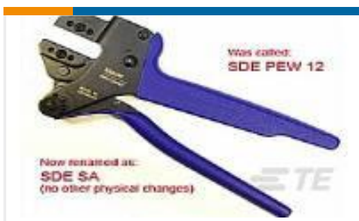
TE Part #1752938-1 PEW 12 TOOL(3-5MM MATE-N-LOK)