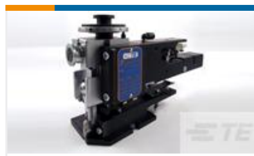
TE Part #2150195-2 OC-AT-E-FA-110F140OV-001-0056