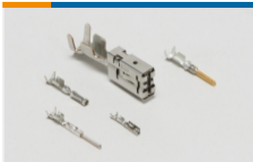
Automotive, Truck, Bus, & Off-Road Terminals(12)