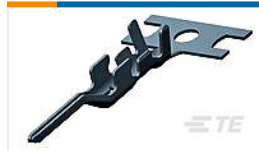
TE Part #2238007-1 TERMINAL, PIN, LANCELESS, 22-26 AWG, EP2