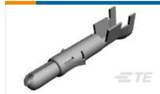
TE Part #350687-2 UMNL SPLIT PIN AUBR