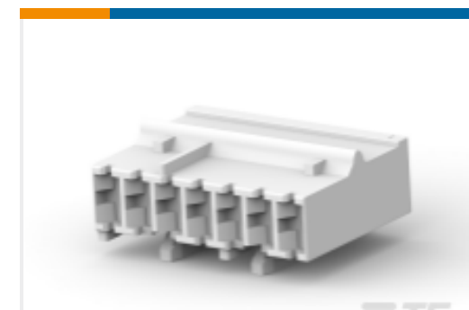
TE Part #5-2295787-7 STD TIMER PLUG HSG 7P W/EXT. LOCKING-SP