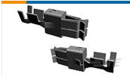
TE Part #964203-1 STD PW TIMER CONTACT