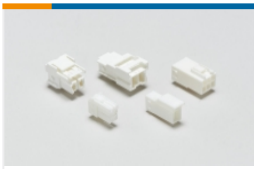
Rectangular Power Connectors(39)