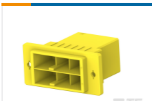
TE Part #6-917809-3 DYNAMIC D-5 TAB HSG D/R 6P Y-Y