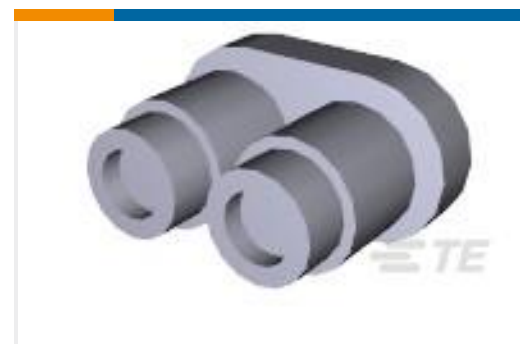
TE Part #794270-1 02P UMNL WIRE SEAL