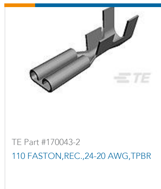
TE Part #170043-2 110 FASTON,REC.,24-20 AWG,TPBR