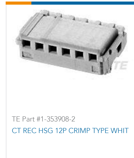
TE Part #1-353908-2 CT REC HSG 12P CRIMP TYPE WHIT