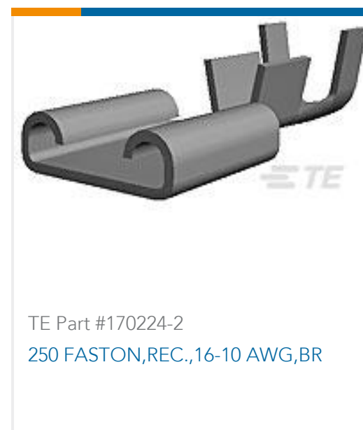
TE Part #170224-2 250 FASTON,REC.,16-10 AWG,BR