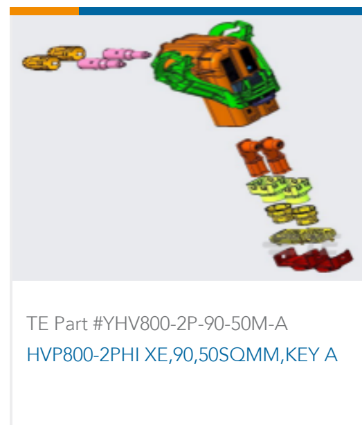
TE Part #YHV800-2P-90-50M-A HVP800-2PHI XE,90,50SQMM,KEY A