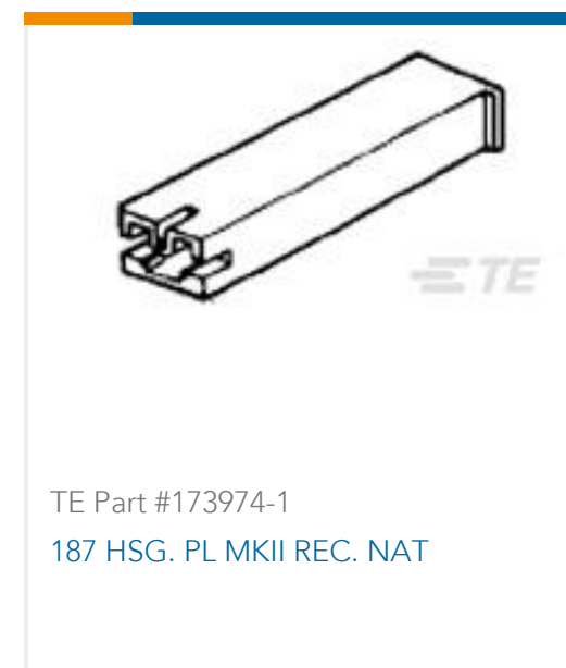
TE Part #173974-1 187 HSG. PL MKII REC. NAT