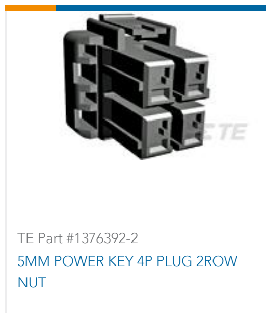
TE Part #1376392-2 5MM POWER KEY 4P PLUG 2ROW NUT