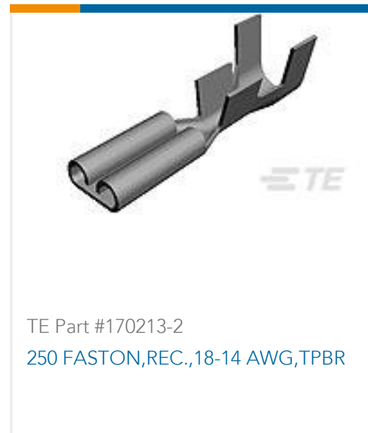
TE Part #170213-2 250 FASTON,REC.,18-14 AWG,TPBR