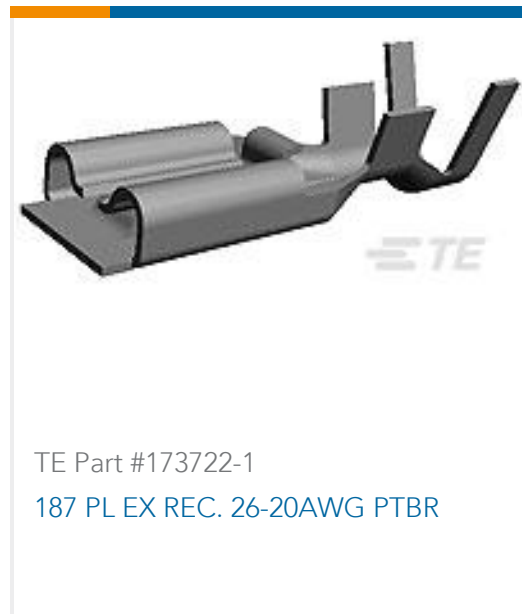
TE Part #173722-1 187 PL EX REC. 26-20AWG PTBR