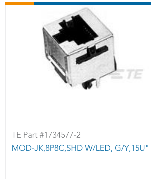
TE Part #1734577-2 MOD-JK,8P8C,SHD W/LED, G/Y,15U"