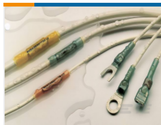
TE Part #157013-000 B-106-1502-S