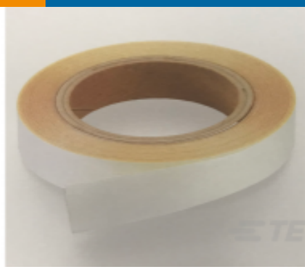
TE Part # 890060-000 S1017-1.0X50