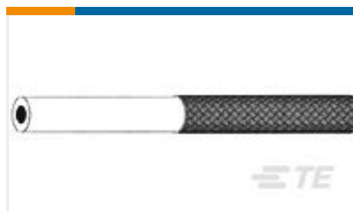
TE Part #2H00143003 RAY-90-20.0(50)