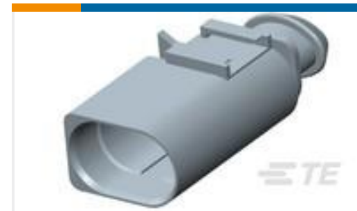
TE Part #1-1703543-0 2POS,TAB 2.8X0.8,TAB HSG,ASSY