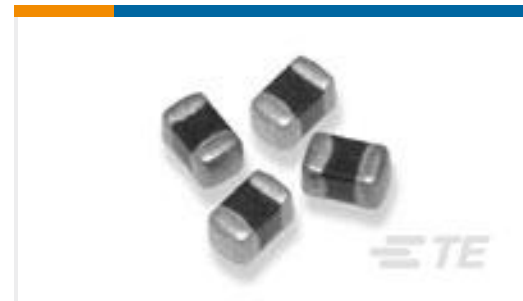
TE Part #5-1624117-1 BMB-B 0805 120R N7