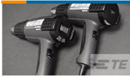
TE Part # CJ2087-000 HL2010E-KIT-120V