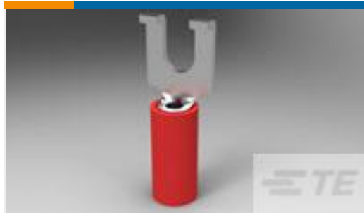
TE Part #8-32561-1 PIDG SPDFLG 22-16COMM22-18MIL6