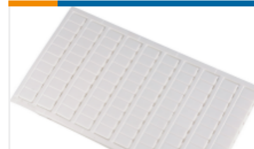
TE Part #1SNK160021R0000 MC812PA 11->20 (x10) Horizontal