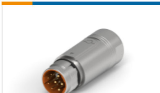
TE Part #BKA199M38590200000 923 EXTENSION, SPEEDTEC-READY