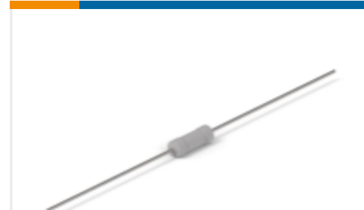
TE Part #5-1676123-4 1/2W SM M/OX 5% 130R