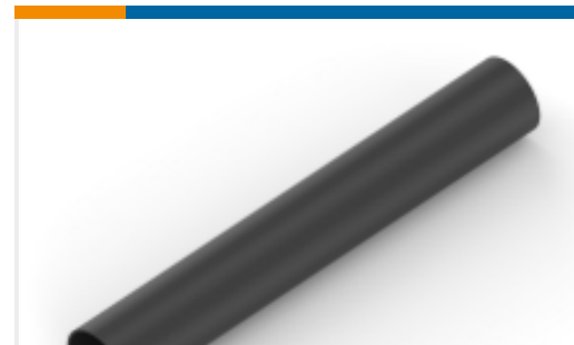
TE Part #NB11234001 ATUM-40/13-0-SP