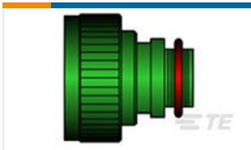
TE Part #019147-000 TXR40AB00-1007AI