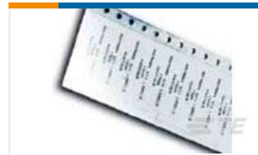
TE Part #003833-000 RMK6-8.5