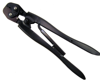
Double Action Hand Tool