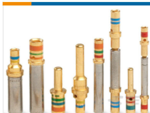
TE Part #2562-201-2031L CONT SOC ASSY