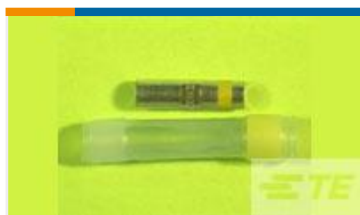
TE Part #6500760004 D-436-38CS454