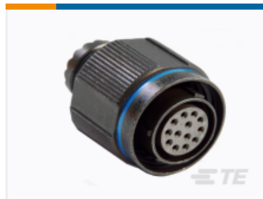
TE Part #DTS26W13-35SN PLUG ASSY