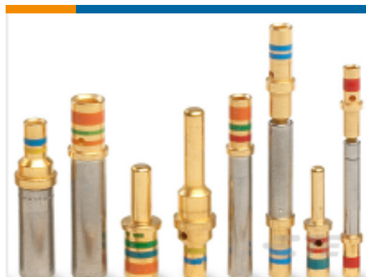
TE Part #2560-215-1631L CONT PIN