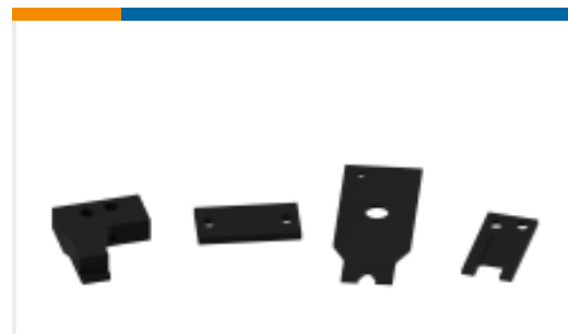
TE Part #3-459722-0 BLADE, SLUG