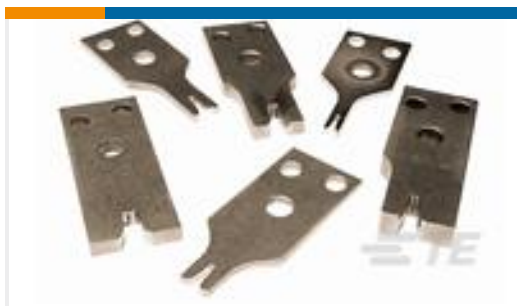
TE Part #1-456405-5 CRIMPER, WIRE .080 "F"