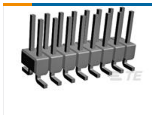
TE Part #1241050-8 2x8P MOD II BREAK AWAY HDR,SMD, BLISTER