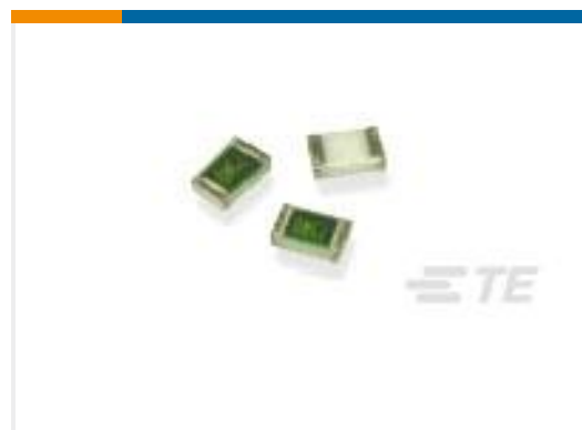
TE Part #1879126-5 RN 0402 115R 0.1% 10PPM 1K RL