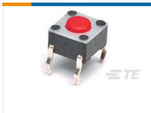
TE Part #1825910-2 FSM2JH=6MM TACT SWITCH, HIGH TEMP