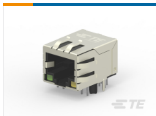
TE Part #1-2301994-2 RJ45 JACK INT.MAG. 1GB LED 1X1