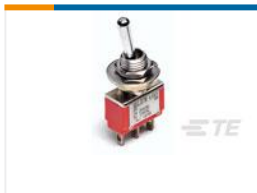
TE Part #1825136-6 A101KD9AQ04