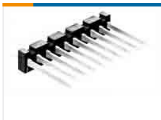
TE Part #1-826539-5 15P MOD 1 UNSHROUDED HEADER, ST, 0.8 Au