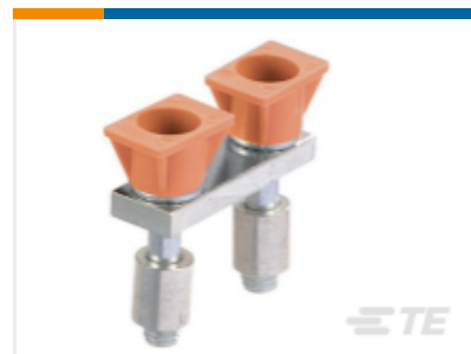
TE Part #1SNK916304R0000 JB16-4