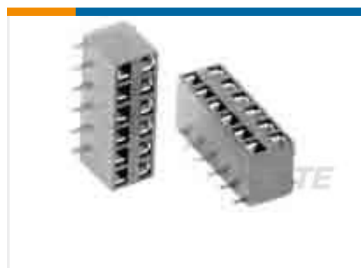
TE Part #966645-6 2x6P HV100 REC. CON, SMD, GOLD, TUBE PACK