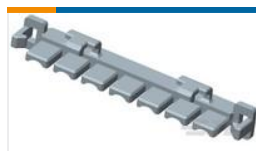
TE Part #1-1969609-2 12P VAL-U-LOK TPA 26-22 AWG