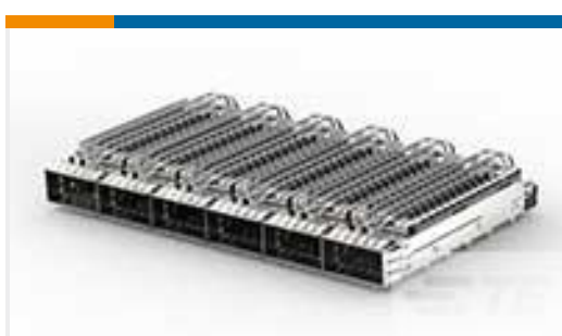
TE Part #2-2170708-1 CAGE ASSY, 1X6, QSFP28, SPRING, HS, LP