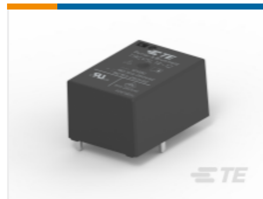
TE Part #1558662-4 T9GV2L14-15