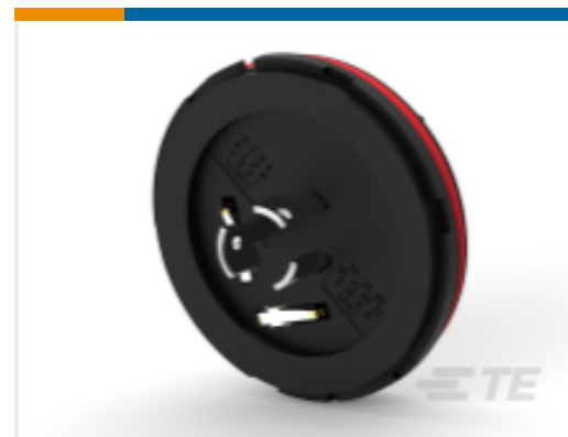
TE Part #1-2336396-1 ASSEMBLY, LIGHT CONTROLLER BASE, W/VENT