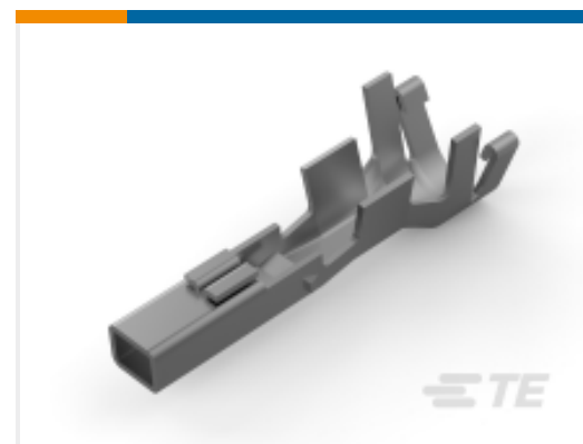
TE Part #177915-9 POWER DBL LOCK REC CONT