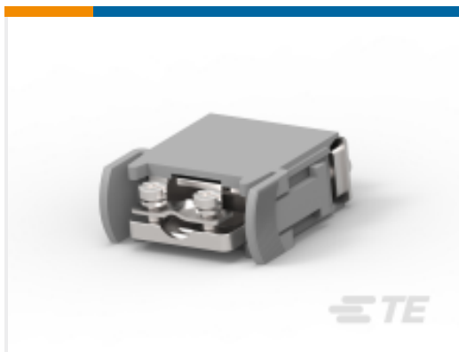
TE Part #T2111092201-007 HMN-009-F