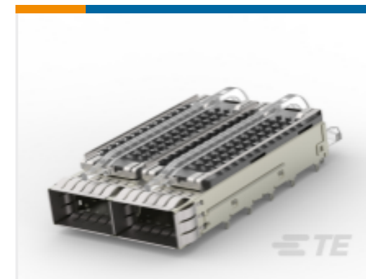
TE Part #2170808-1 QSFP28, 1X2, CAGE ASSY, SPRING, HS, LP