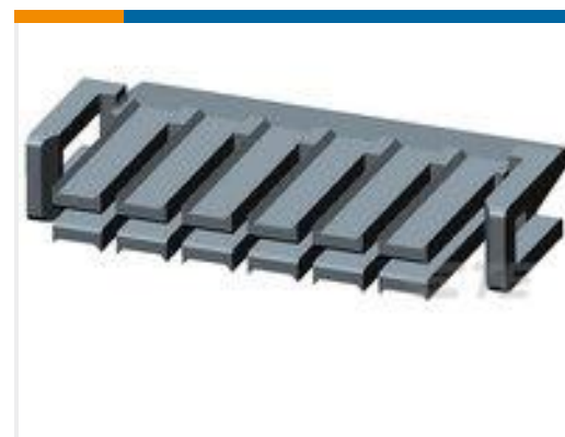
TE Part #2-1969541-8 RETAINER, TPA, DUAL ROW, EP2.5