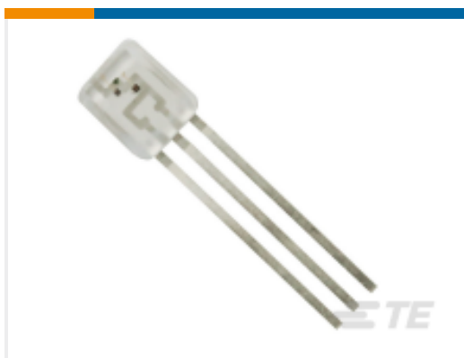
TE Part #11032254-00 EMITTER 660/940NM 1 2