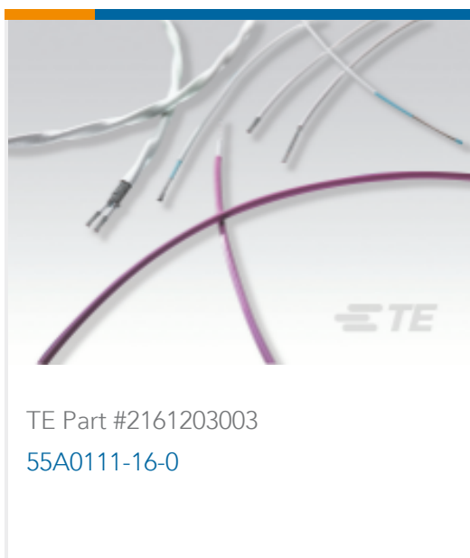
TE Part #2161203003 55A0111-16-0