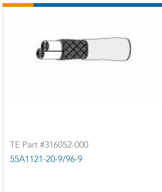
TE Part #316052-000 55A1121-20-9/96-9