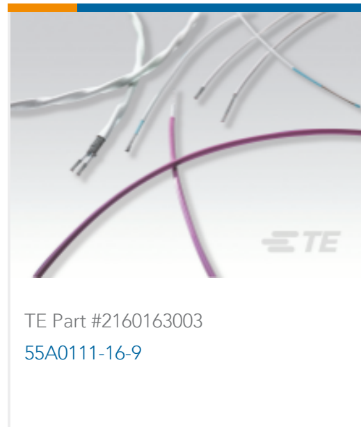
TE Part #2160163003 55A0111-16-9