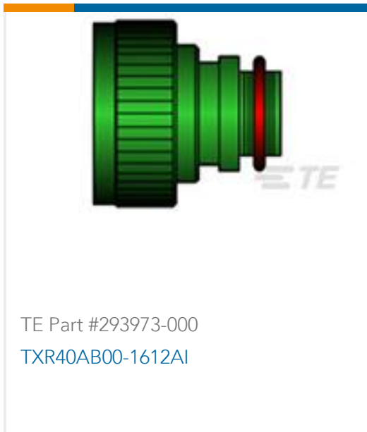
TE Part #293973-000 TXR40AB00-1612AI