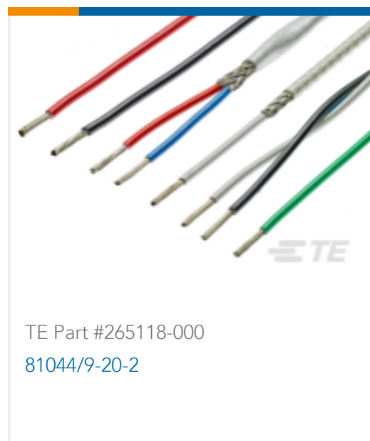
TE Part #265118-000 81044/9-20-2