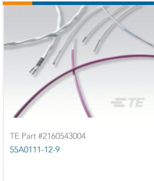
TE Part #2160543004 55A0111-12-9