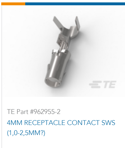
TE Part #962955-2 4MM RECEPTACLE CONTACT SWS (1,0-2,5MM?)