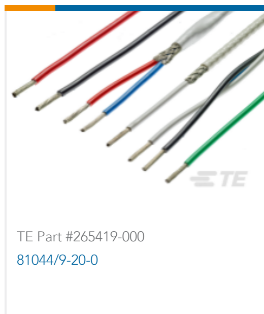
TE Part #265419-000 81044/9-20-0