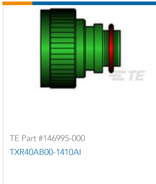
TE Part #146995-000 TXR40AB00-1410AI