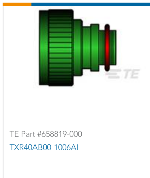
TE Part #658819-000 TXR40AB00-1006AI