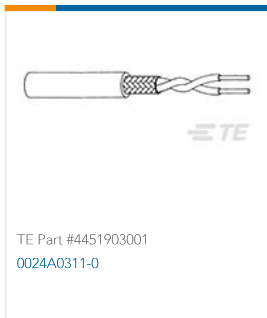
TE Part #4451903001 0024A0311-0