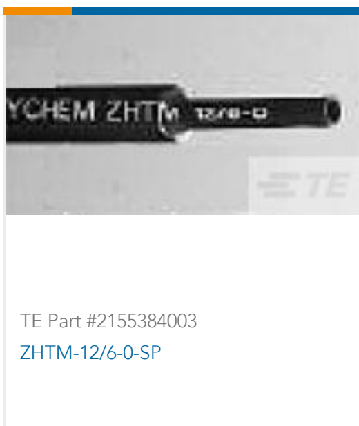
TE Part #2155384003 ZHTM-12/6-0-SP