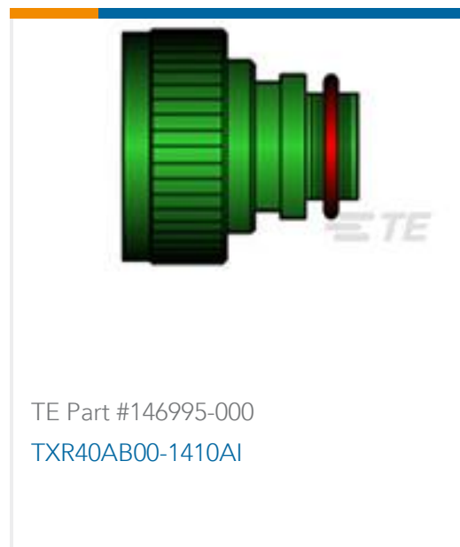
TE Part #146995-000 TXR40AB00-1410AI