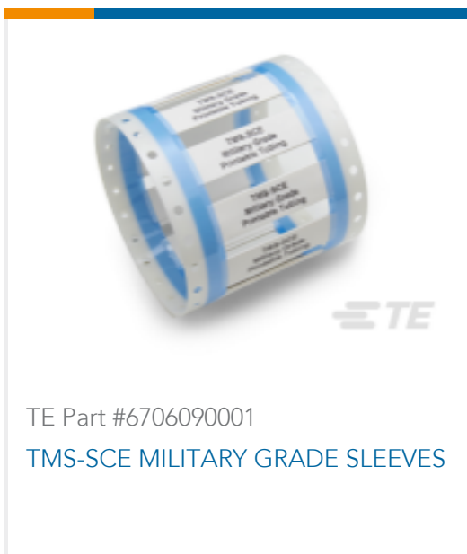
TE Part #6706090001 TMS-SCE MILITARY GRADE SLEEVES