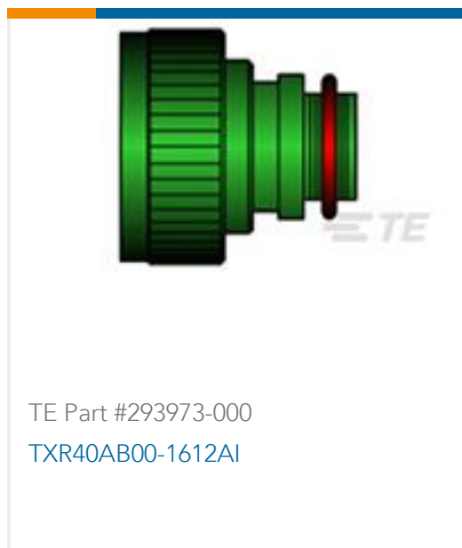
TE Part #293973-000 TXR40AB00-1612AI