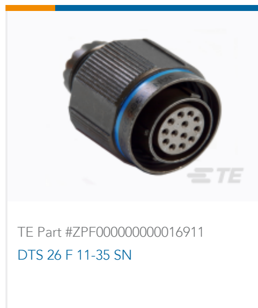
TE Part #ZPF000000000016911 DTS 26 F 11-35 SN